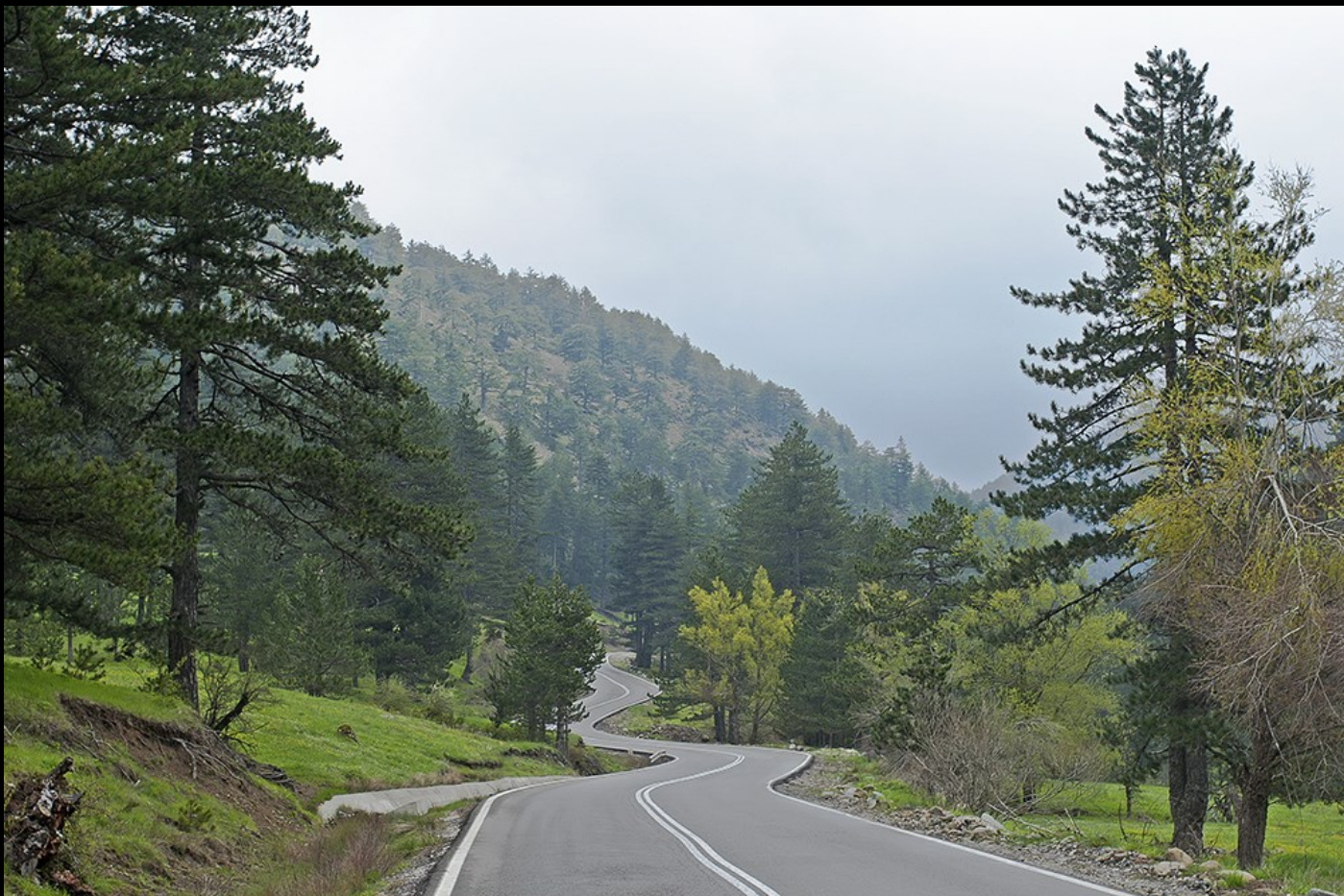
Our first stop in Milia.