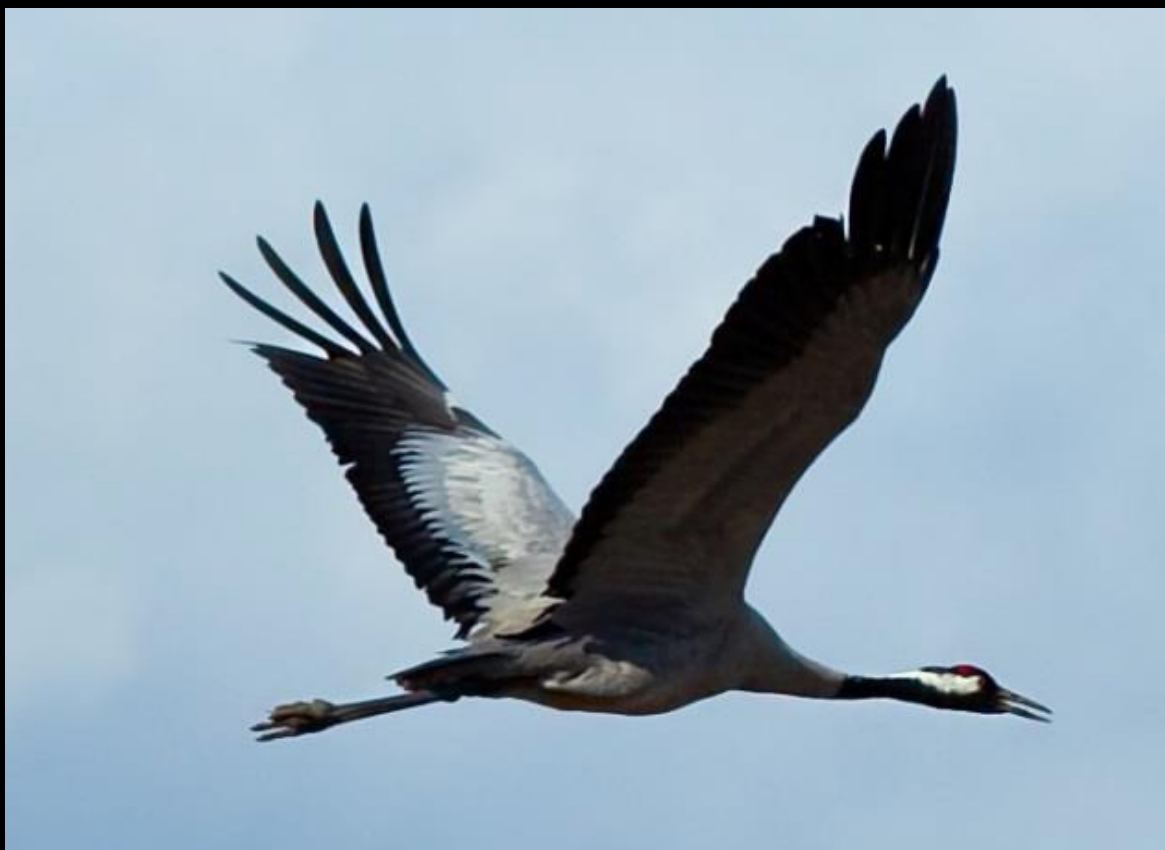
The Common Eurasian Crane " Grus grus "