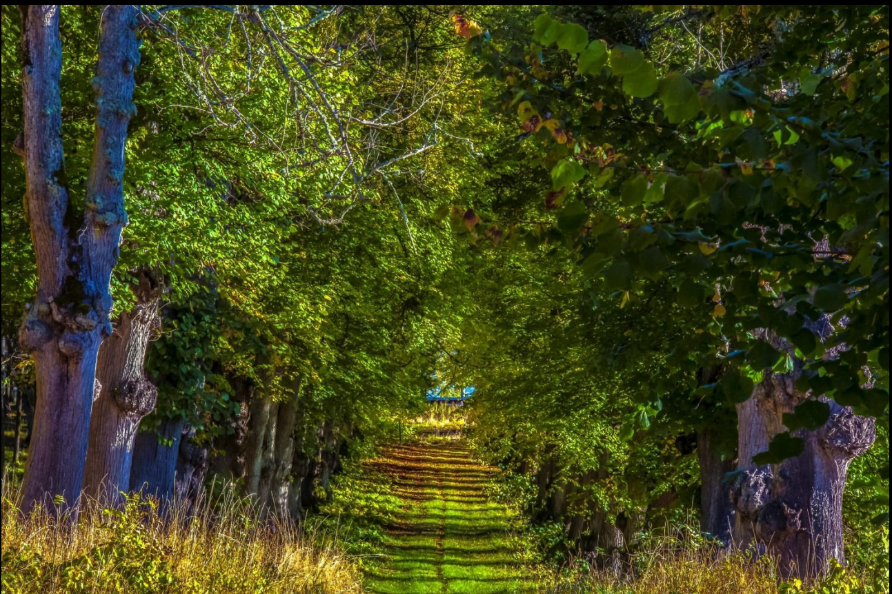
The wonderful alley at summertime