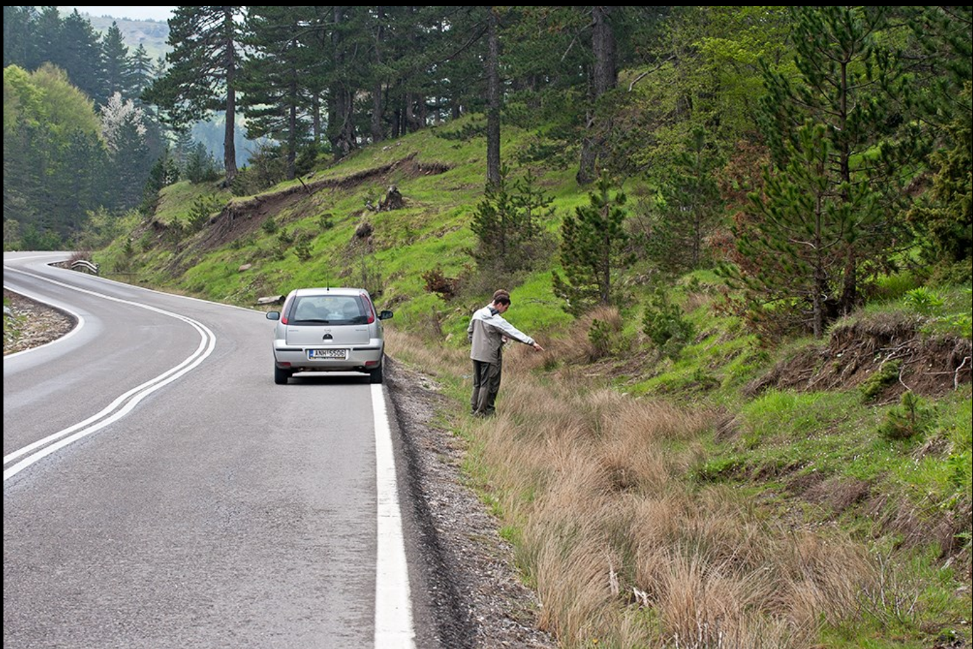
We discovered a ditch full of newts and frogs just aside the road.