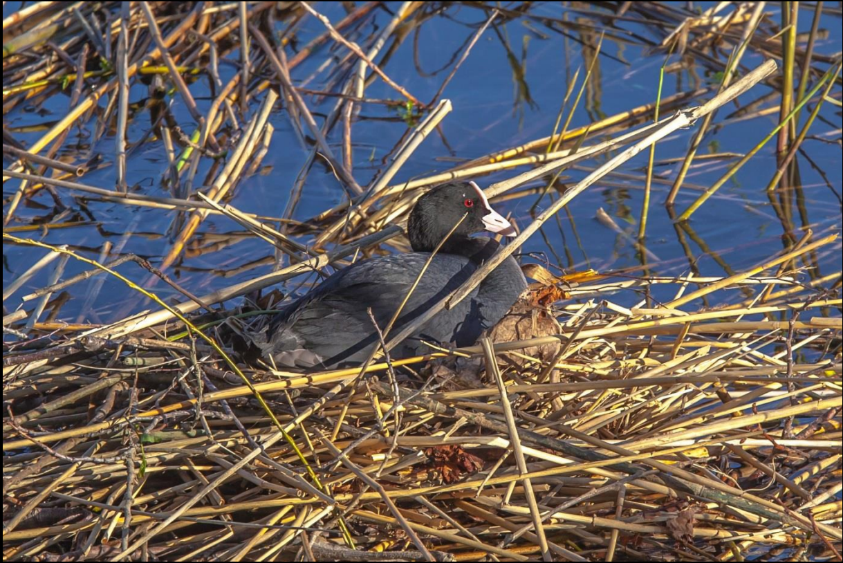
The Eurasian Coot " Fulica atra " laying on eggs