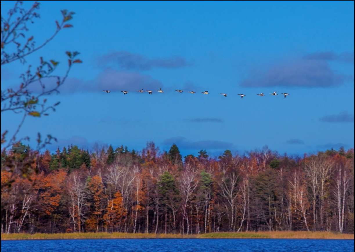
The Common Merganser or Goosander " Mergus merganser "