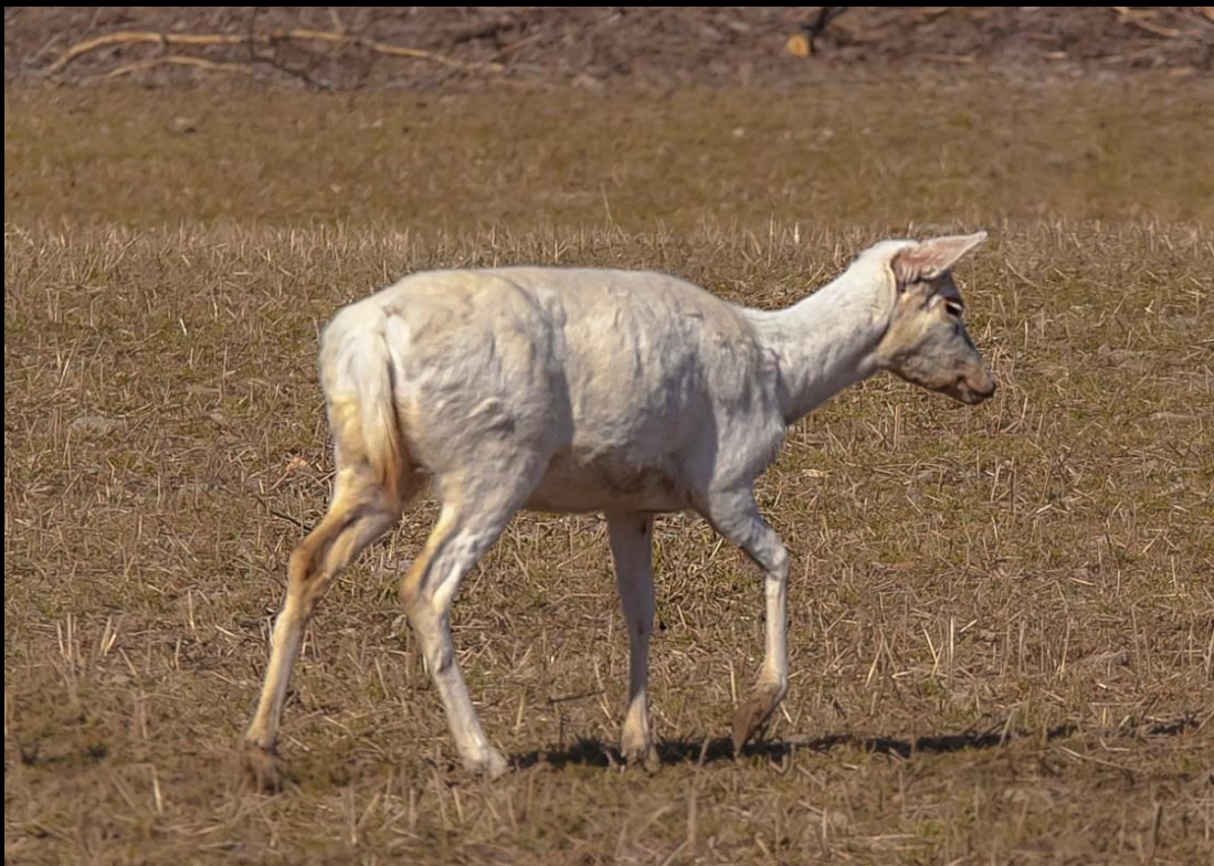
A white Fallow deer ( Dama dama )