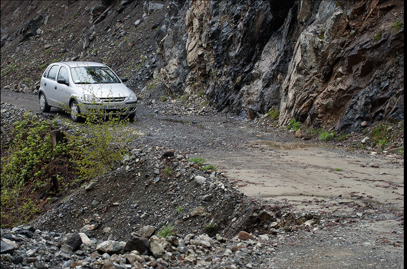
The loggers road was full of pit holes.