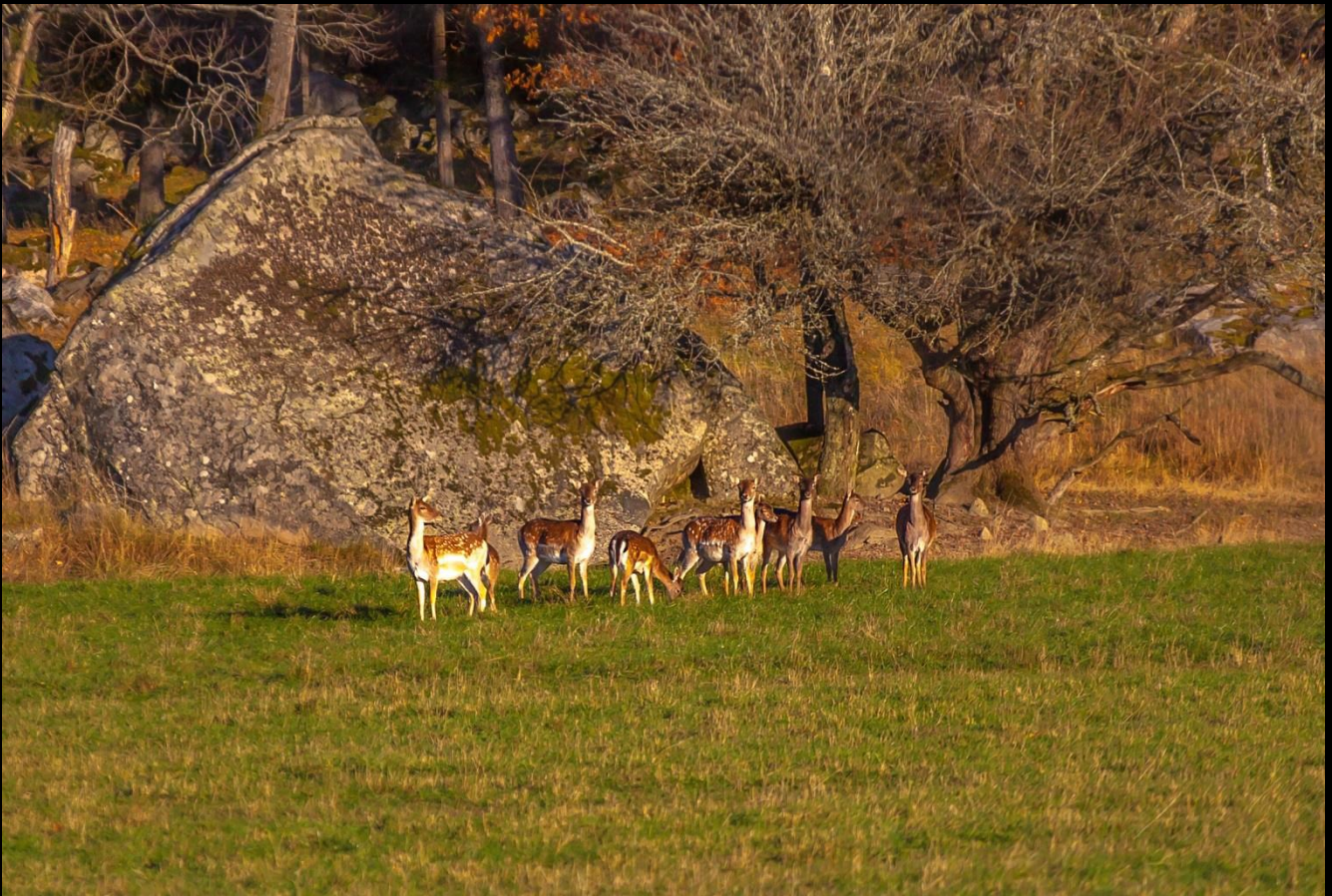
Some of his not so white friends