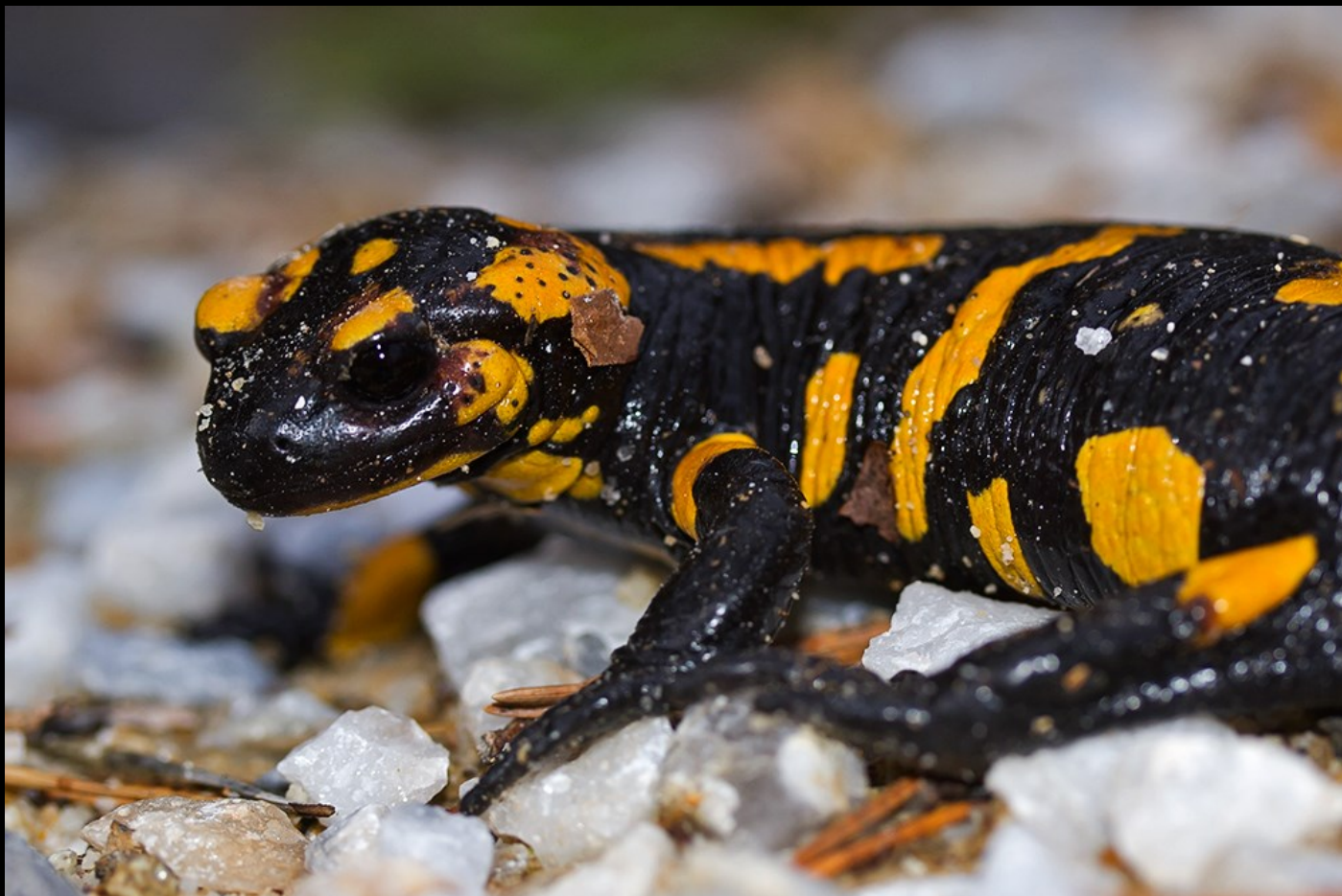
A Fire Salamander ( Salamandra salamandra ) on the logger's road.