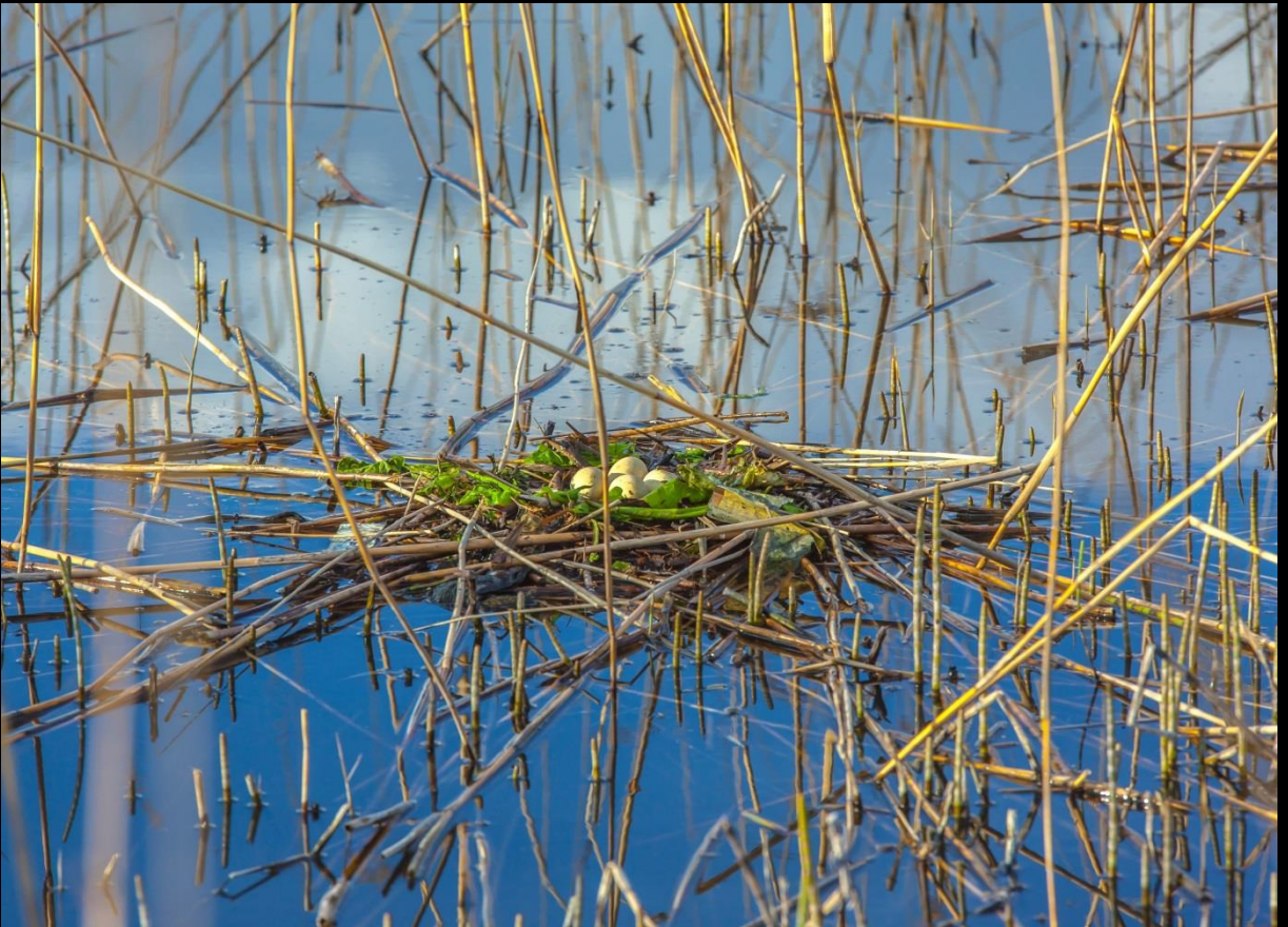
The eggs left alone while fishing