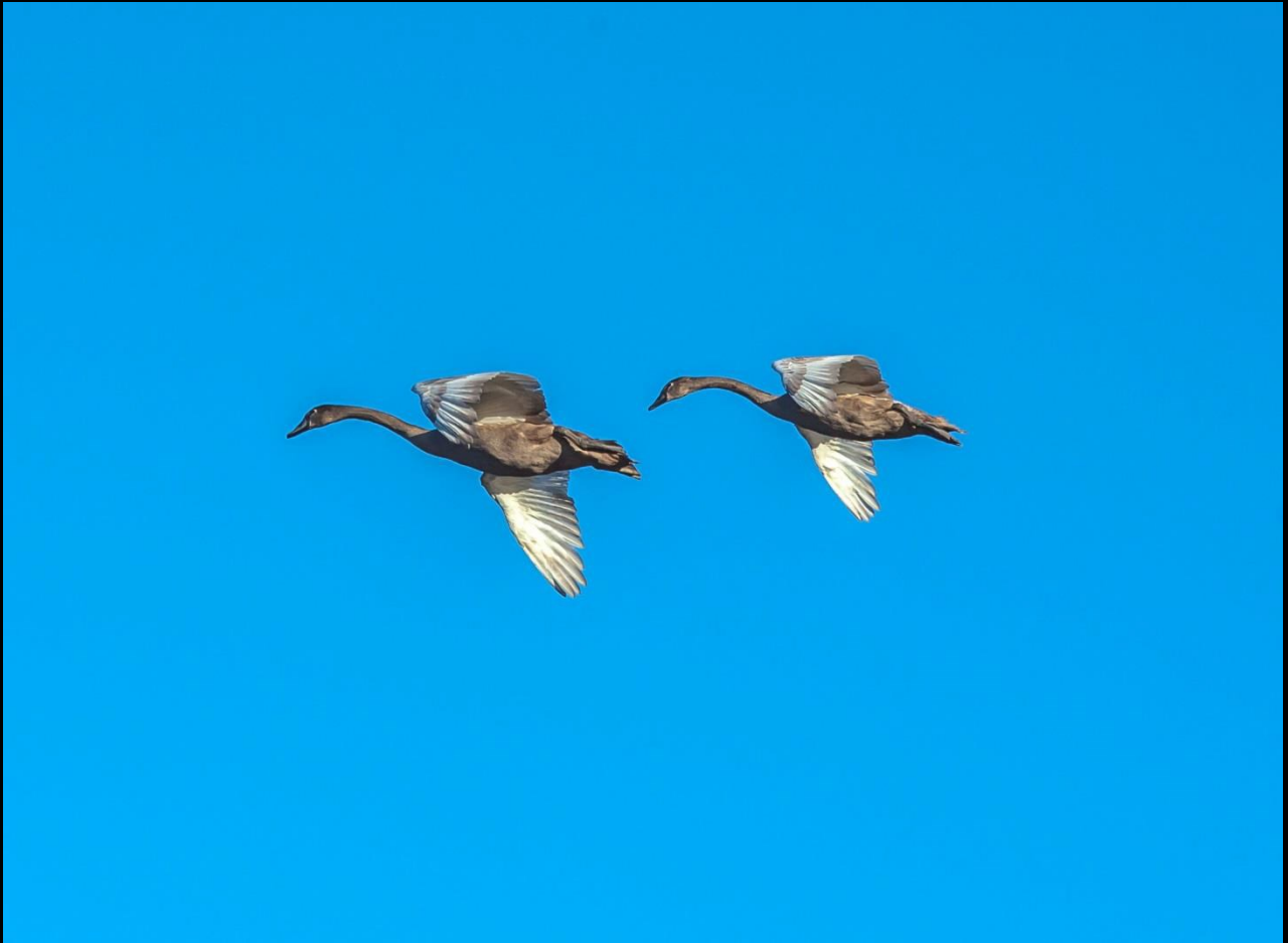
Two young Whooper Swans “ Cygnus Cygnus ”