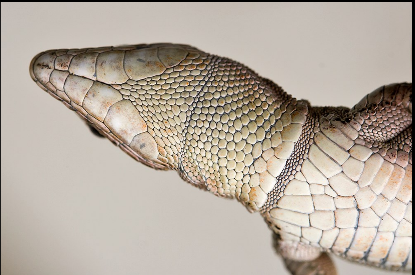
The collar of a Wall Lizard ( Podarcis muralis )