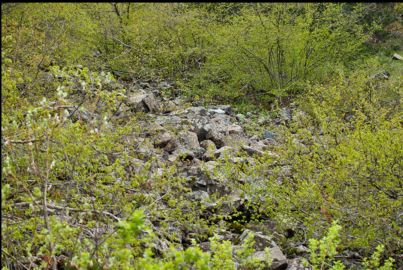
Granite boulders, perfect home for Adders.