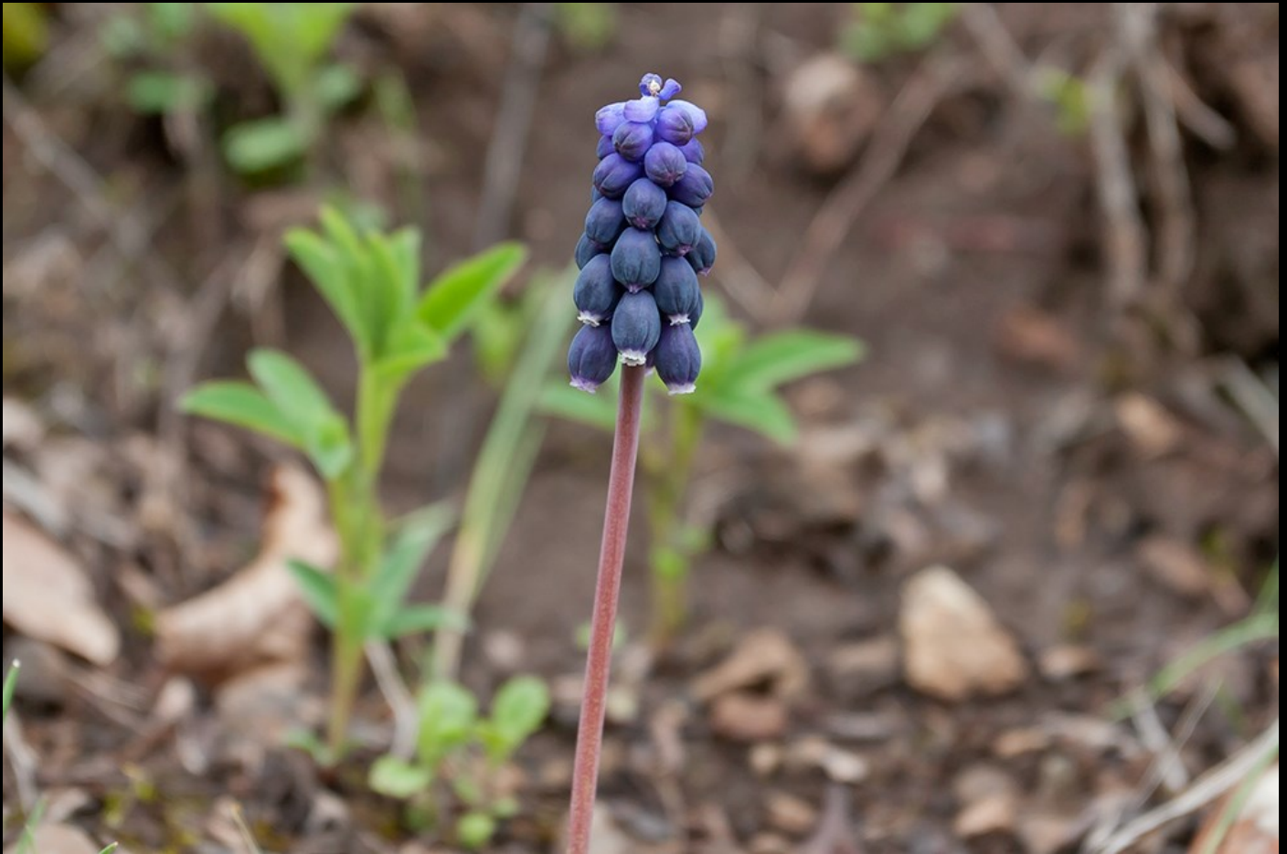
Grape Hyacinth Muscari botryoides .