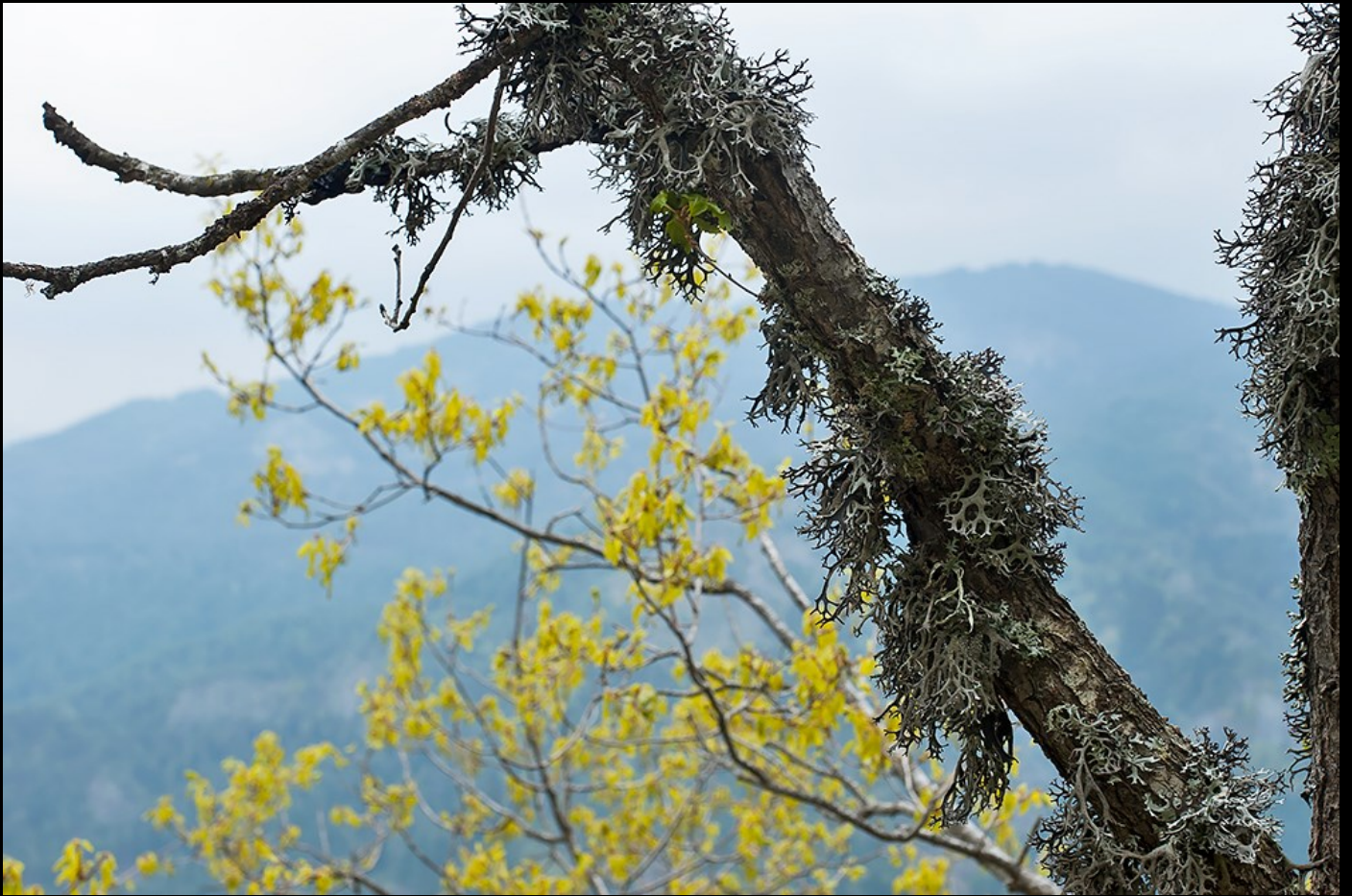
Lichens. Milia, Greece.