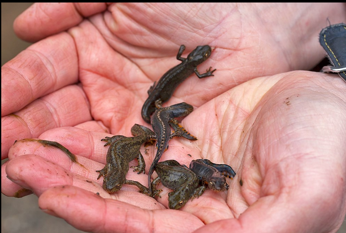
A handful of Newts. Milia, Greece.