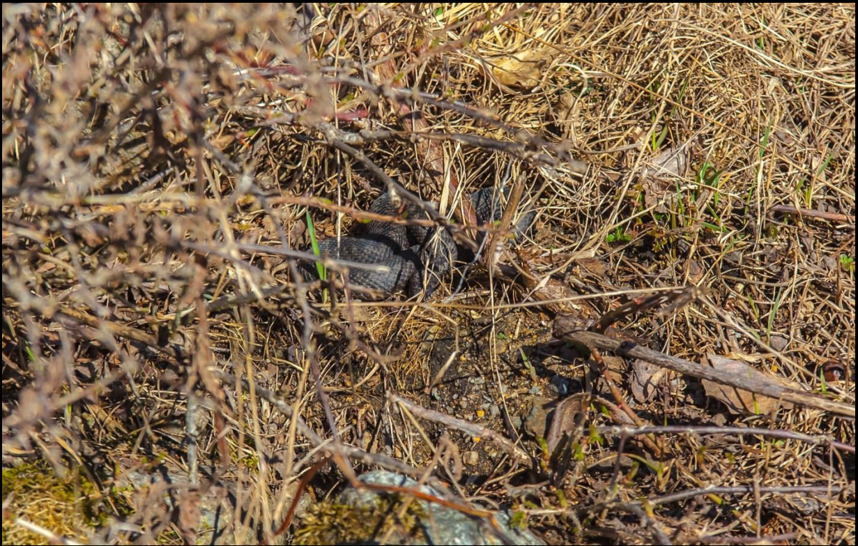
An early common European adder or viper “ Vipera berus ”