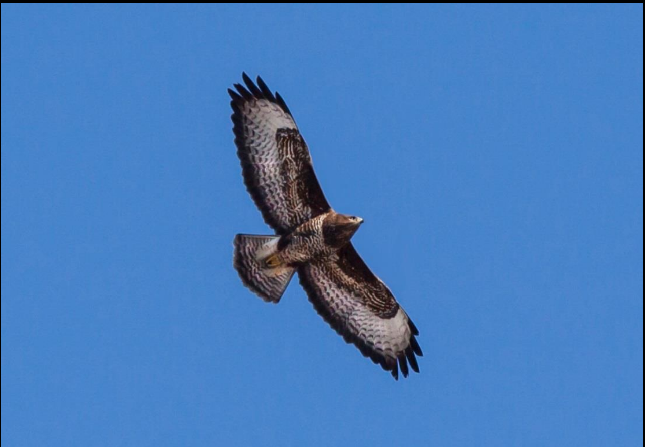
The Common Buzzard " Buteo buteo " you can see here every day