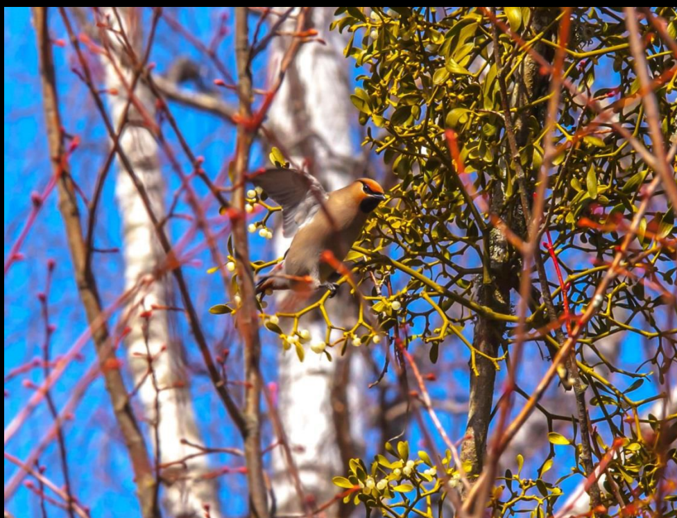
The Bohemian Waxwing ( Bombycilla garrulus ) is also found here, eating mistletoe berries