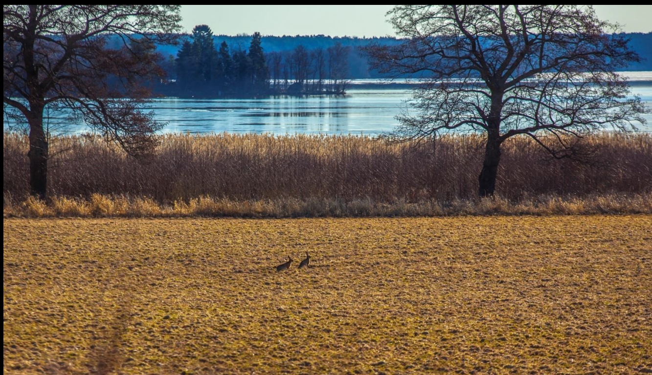
Two European hares " Lepus europaeus " early in the morning at Hässelbyholm