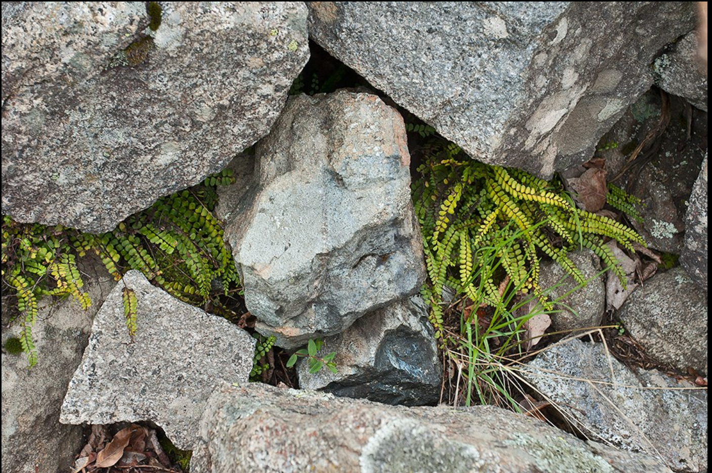
Granite and ferns.