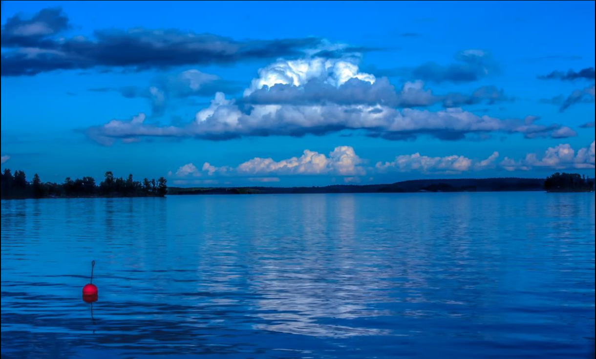
Early morning at Hässelbyholm