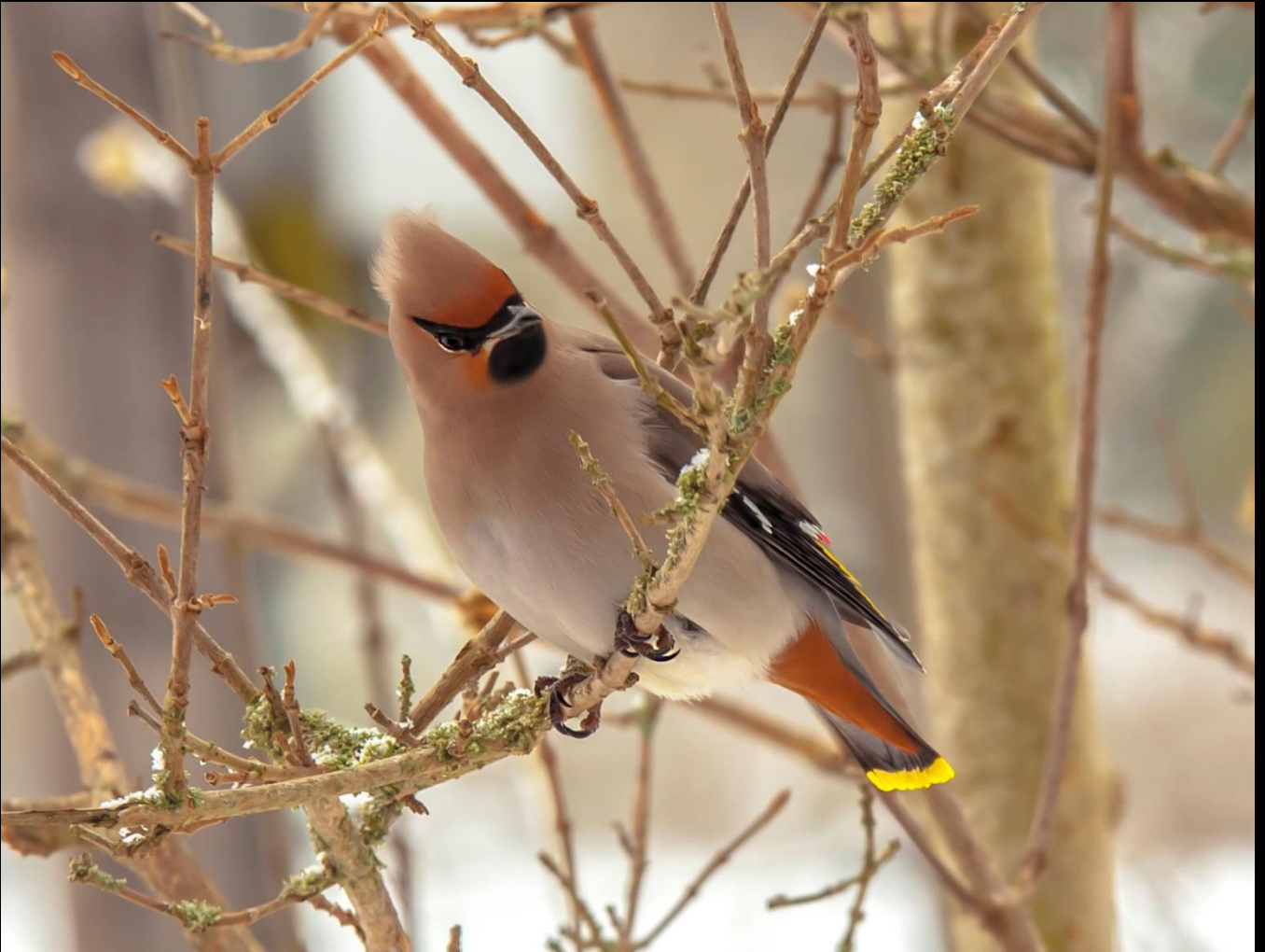
The Bohemian Waxwing ( Bombycilla garrulus ) is also found here, eating mistletoe berries