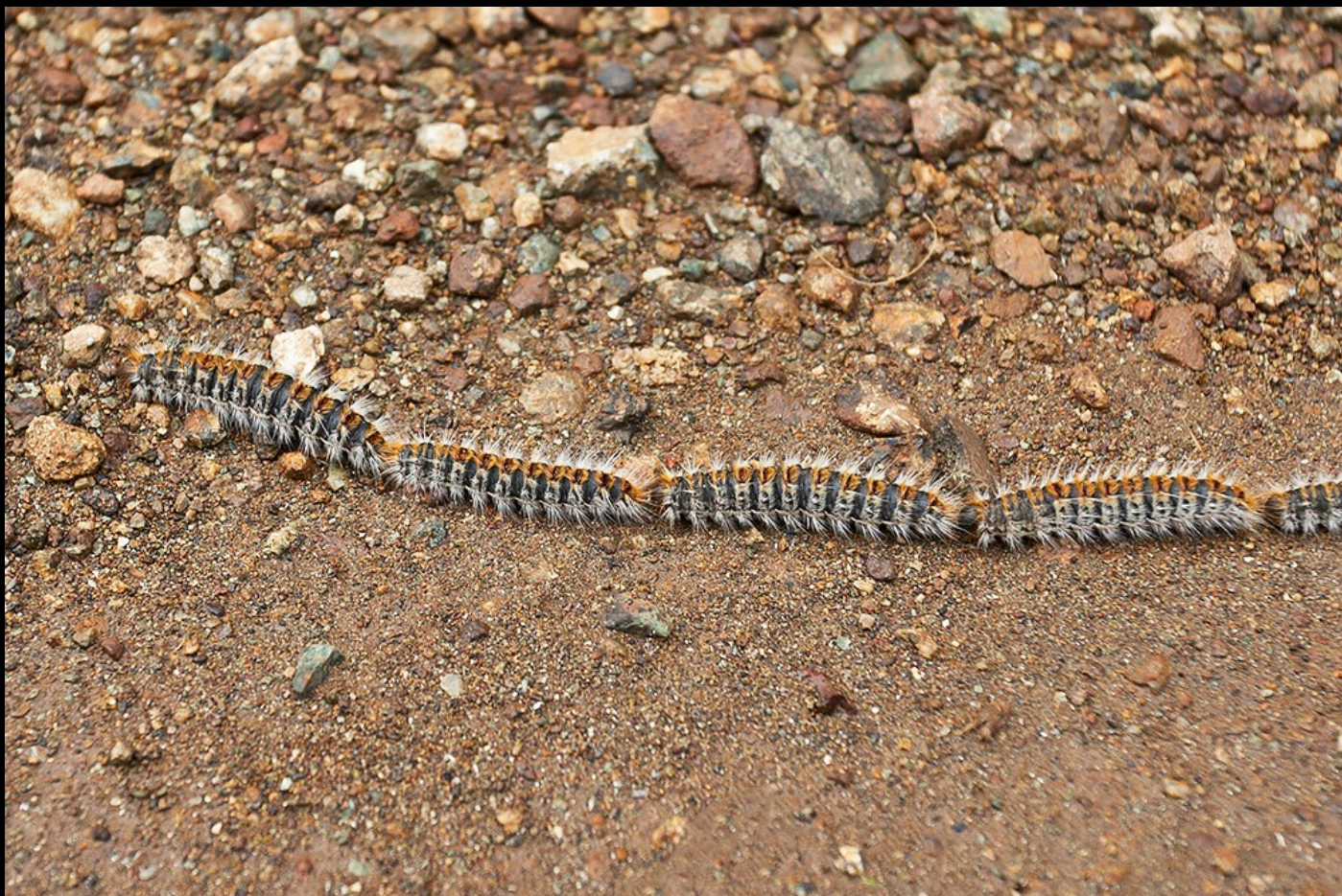
The Pine Killer. The Eastern Pine Processionary ( Thaumtopoea pinivora )