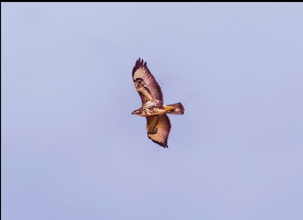
The Rough-legged Buzzard "Buteo lagopus"