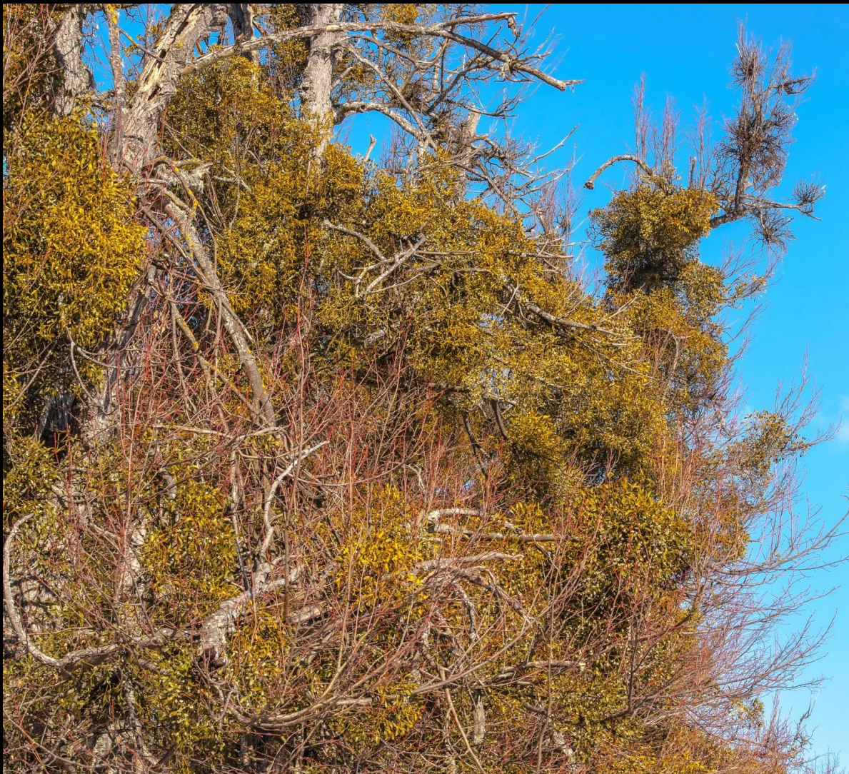
A Small-leaved Lime " Tilia cordata " filled with Mistletoe Viscum album "