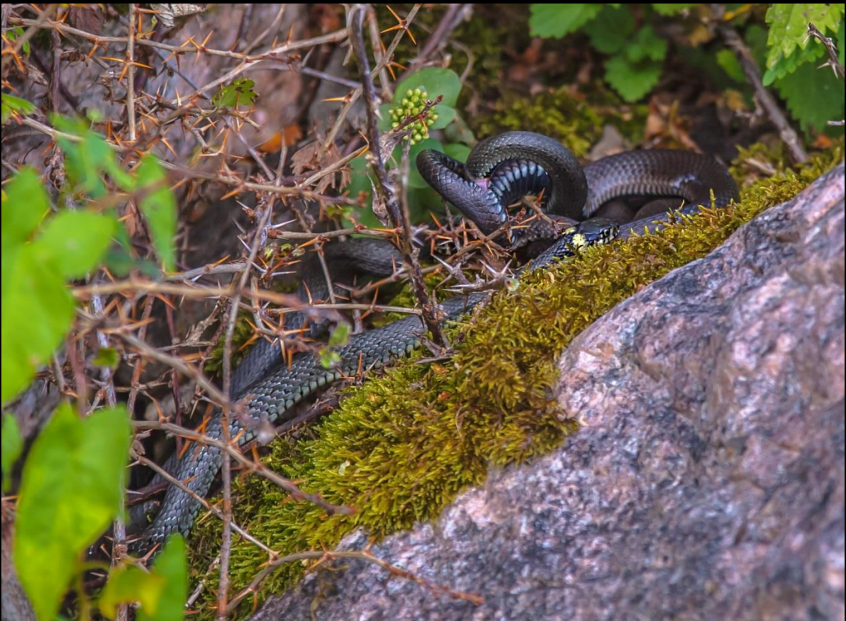
This was a really fun day with snake penetration