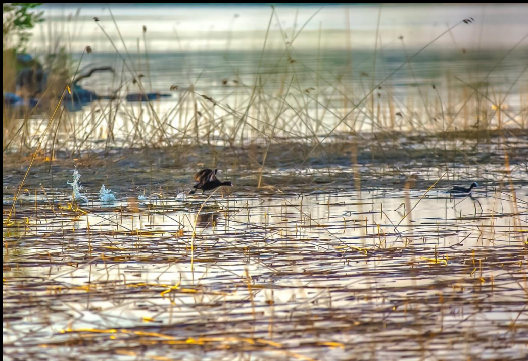
The Eurasian Coot " Fulica atra "