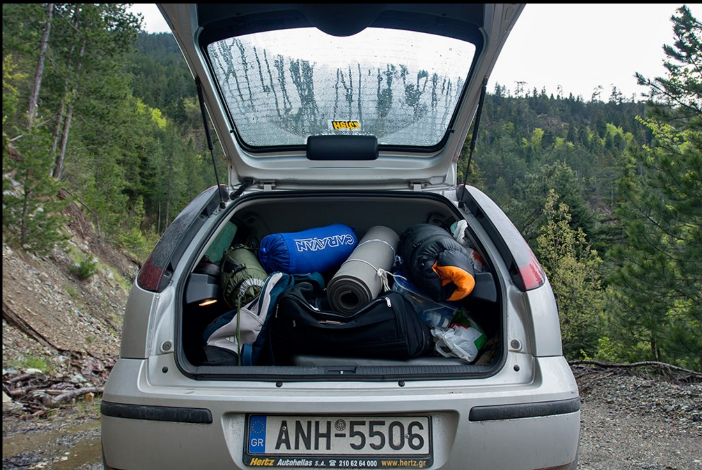
Our hire car with well packed things in the back.