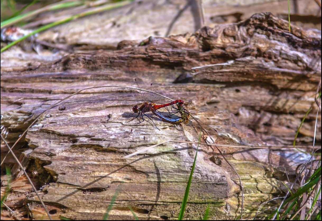
place where one finds a lot of different dragonflies