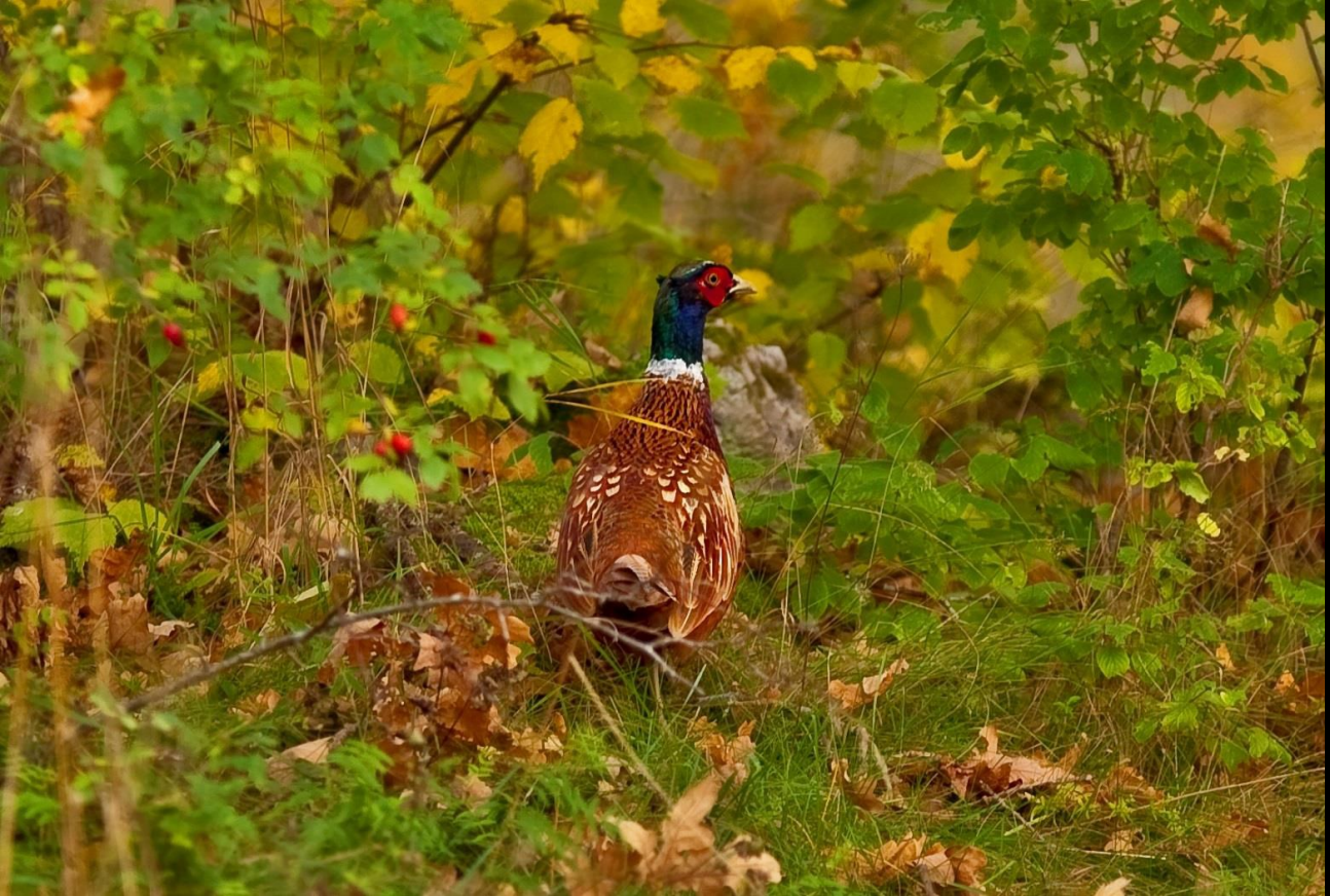
The Common Pheasant "Phasianus colchicus"