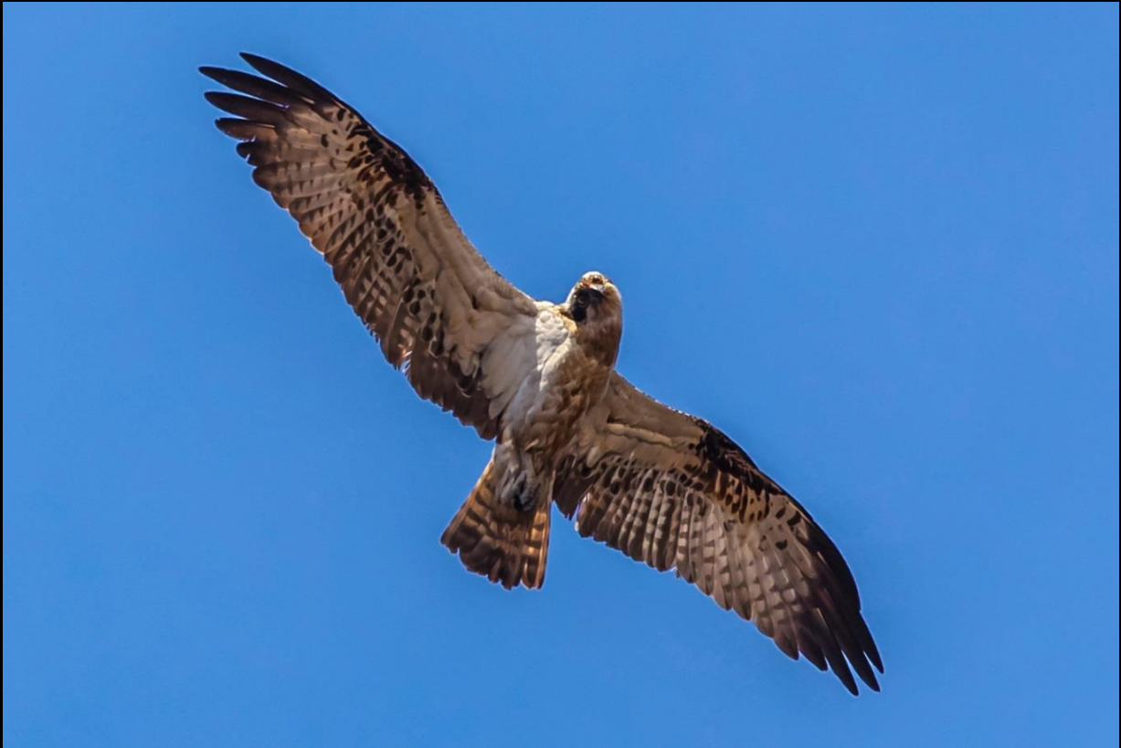
Osprey "Pandion haliaetus"