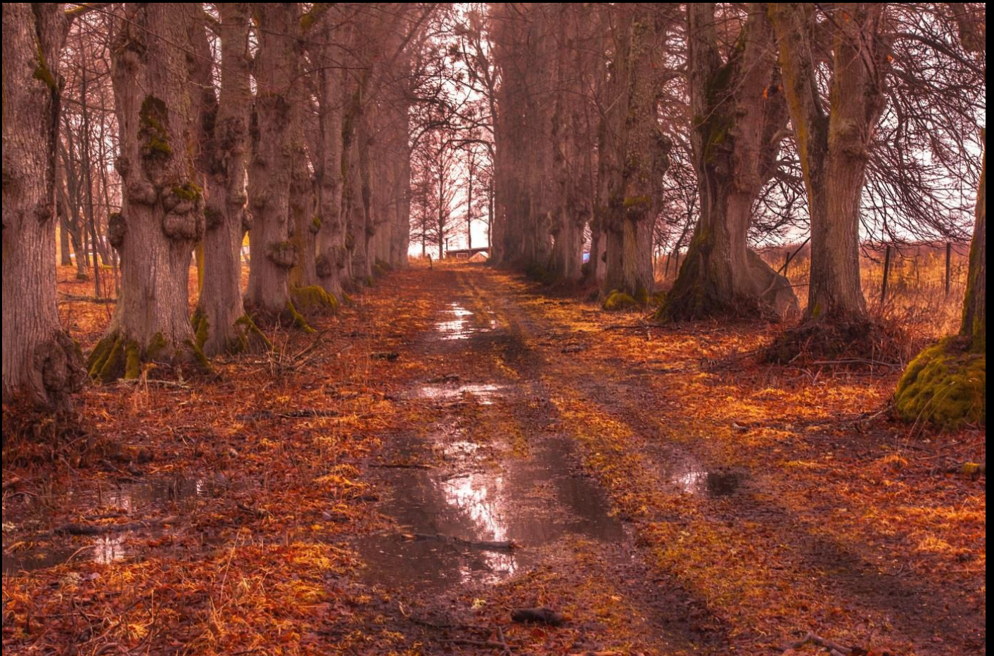
Small-leaved Lime ” Tilia cordata ” – alley (autumn/fall)