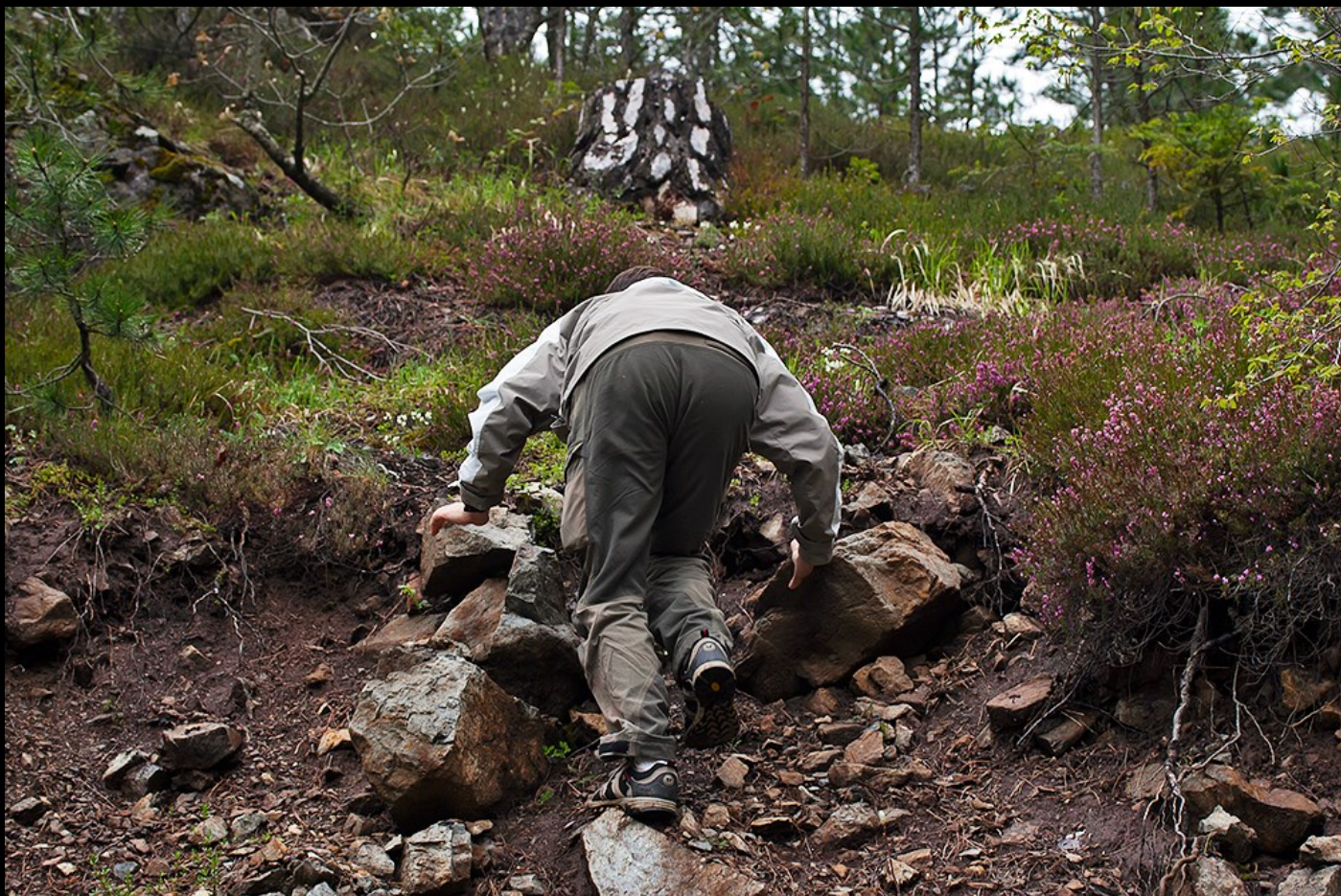
Wet and slippery stones.