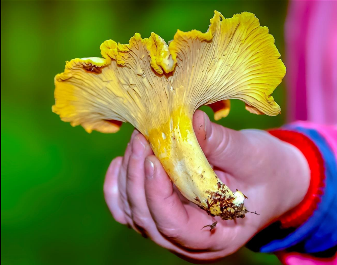
A really big chanterelle " Cantharellus cibarius ". You find different kinds of chanterelles in the area. Just to pick and eat. Really tasty.