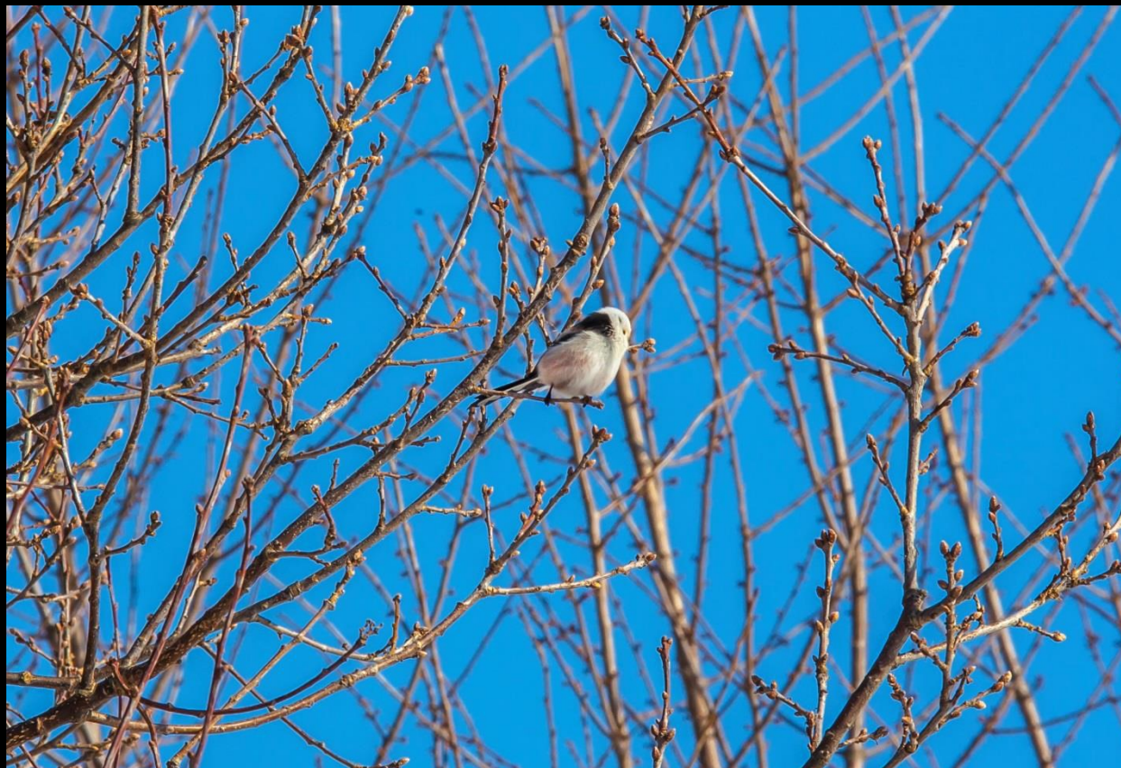
The Long-tailed Tit or Long-tailed Bushtit " Aegithalos caudatus "