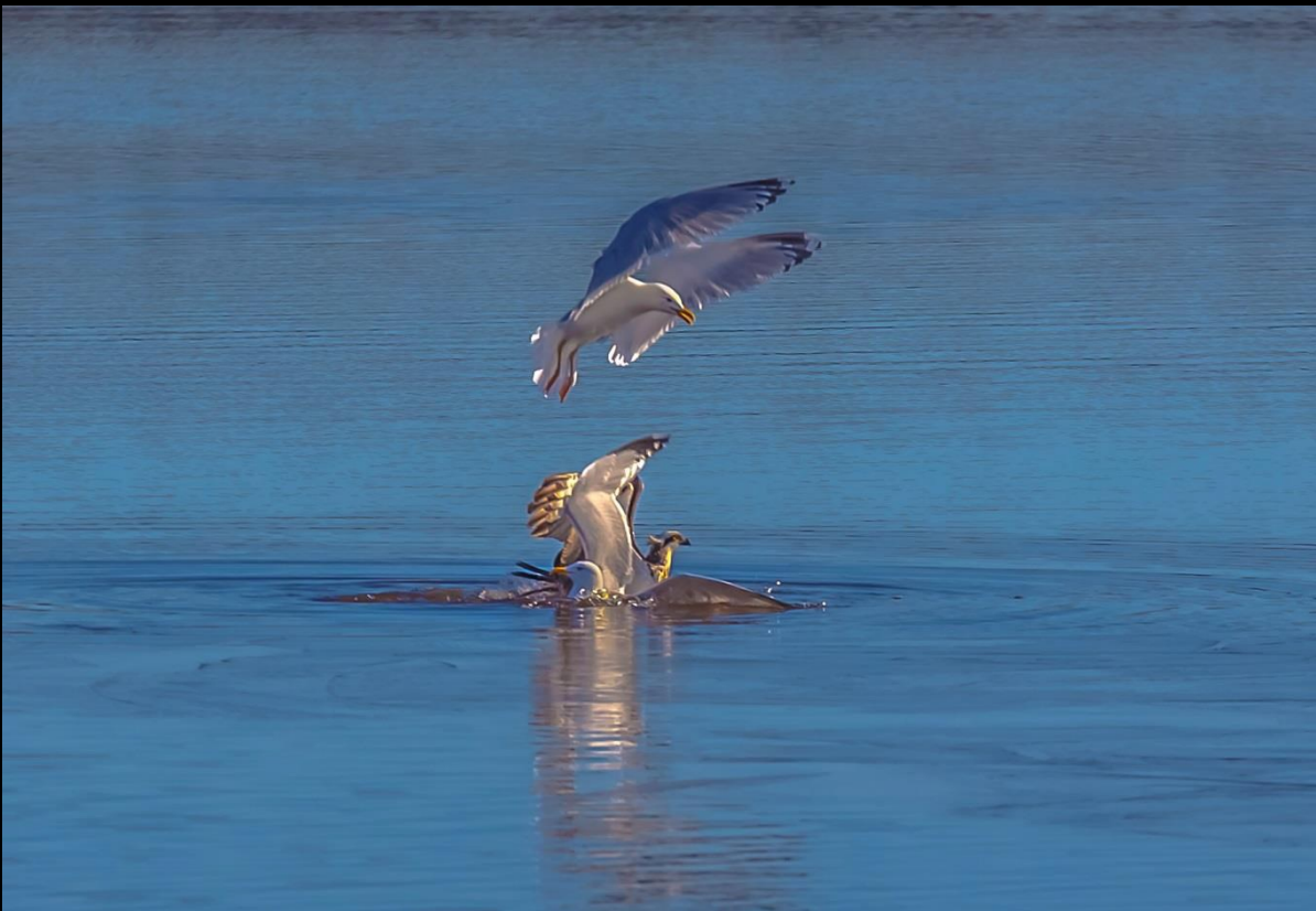
Osprey "Pandion haliaetus" fighting over fish with some European Herring Gulls "Larus argentatus"