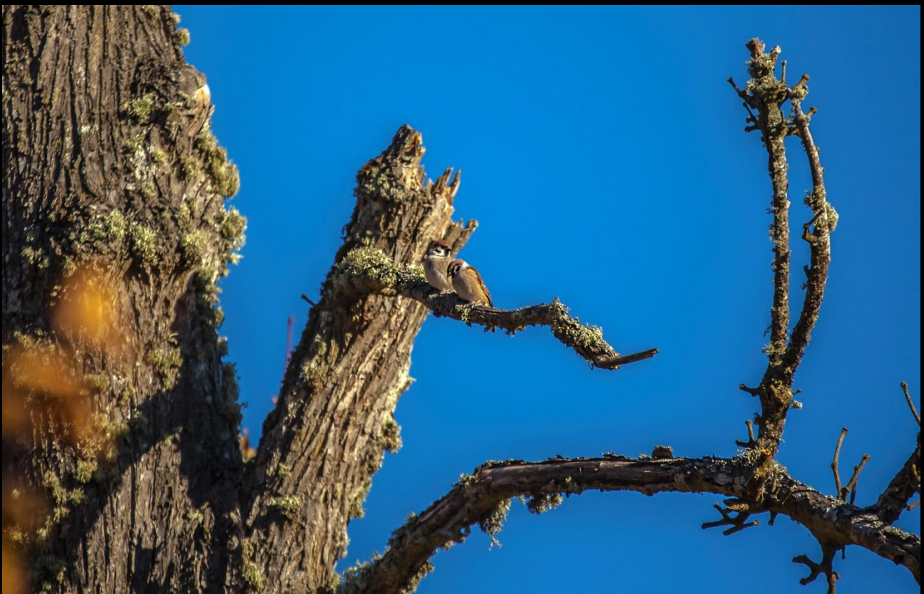
The Eurasian Tree Sparrow " Passer montanus "