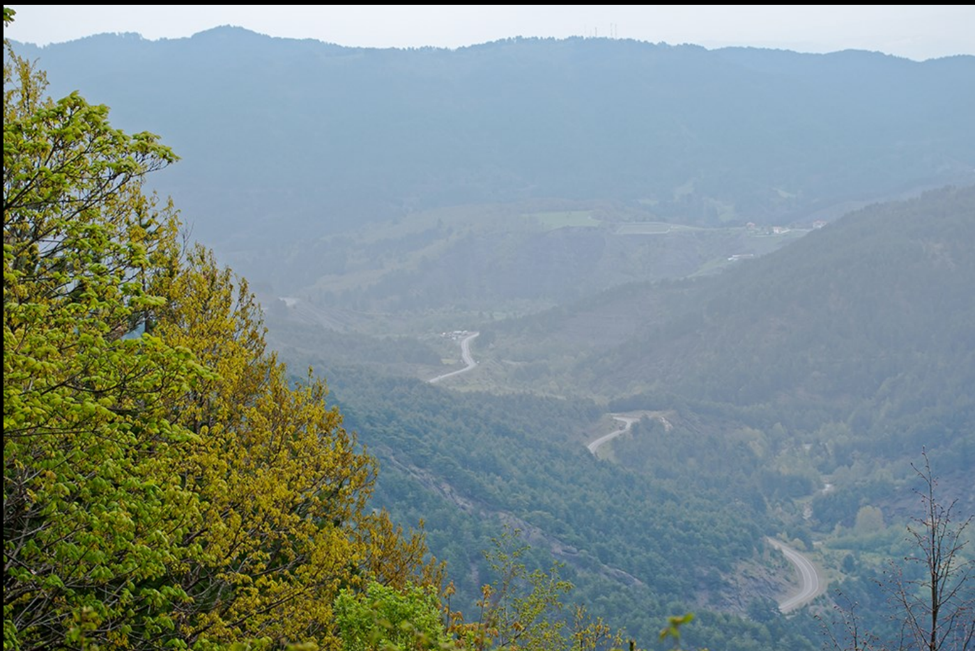
The snaking road down in the walley.