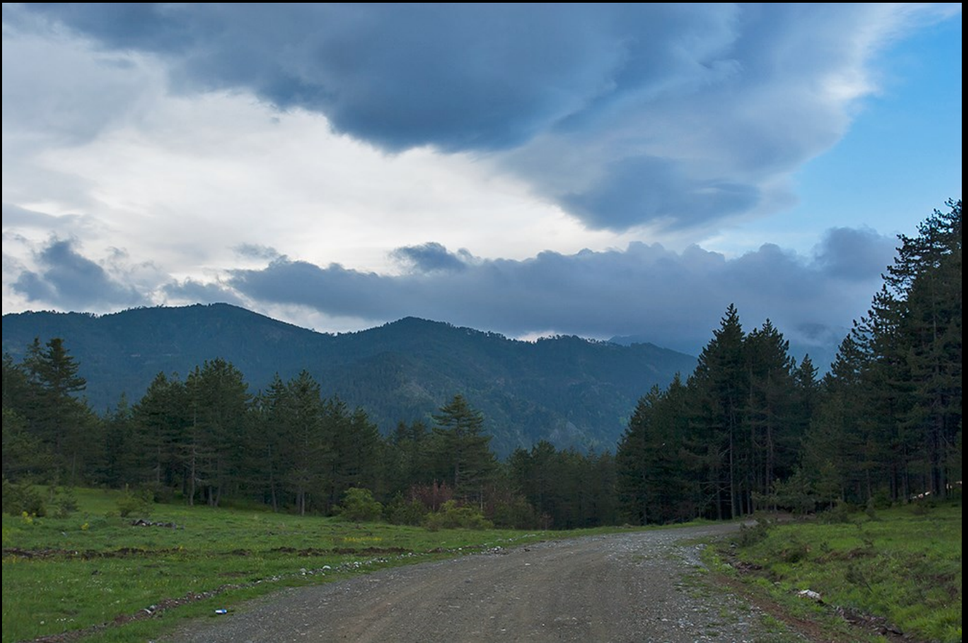
It was cold before the sun rise.