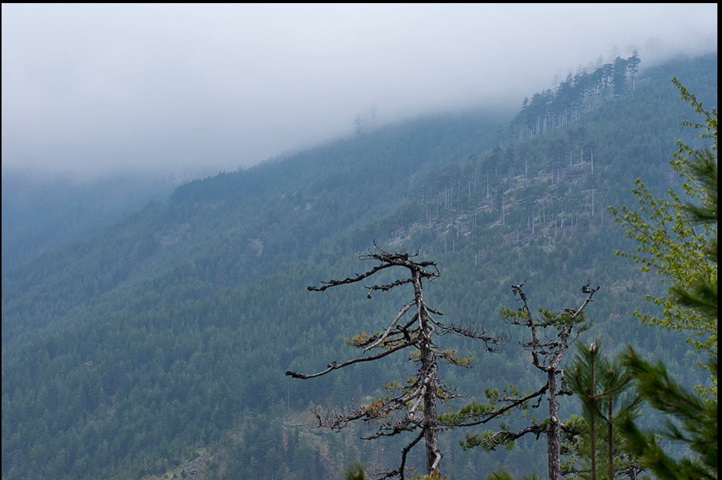
Misty mountains and deep forests.