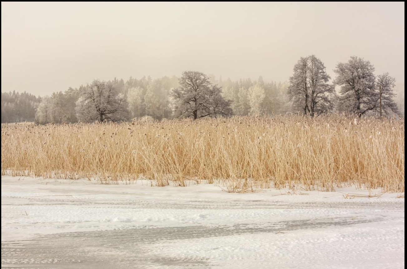
A really cold morning