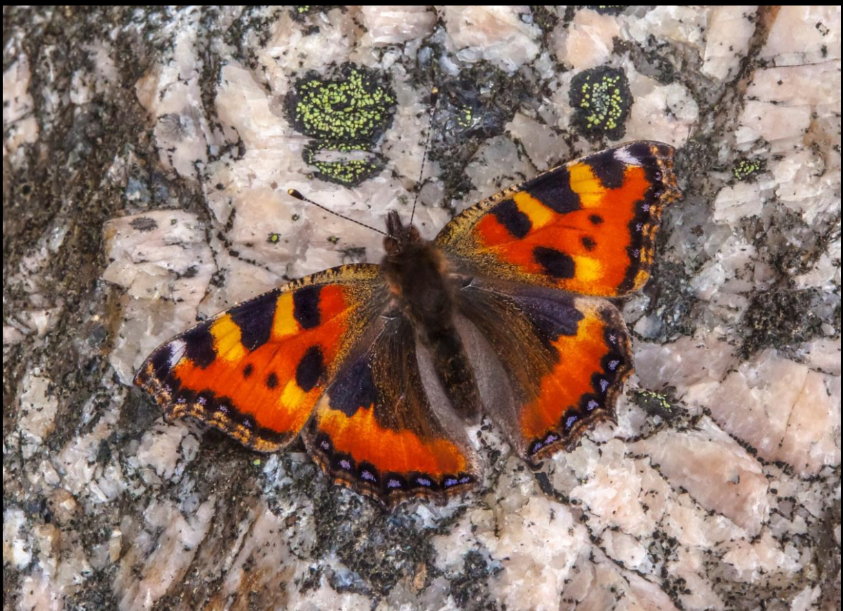
The Small Tortoiseshell " Aglais urticae "