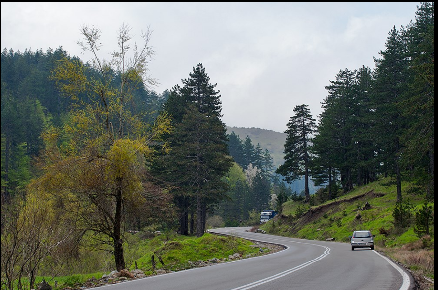
The road downwards the mountain, Milia.