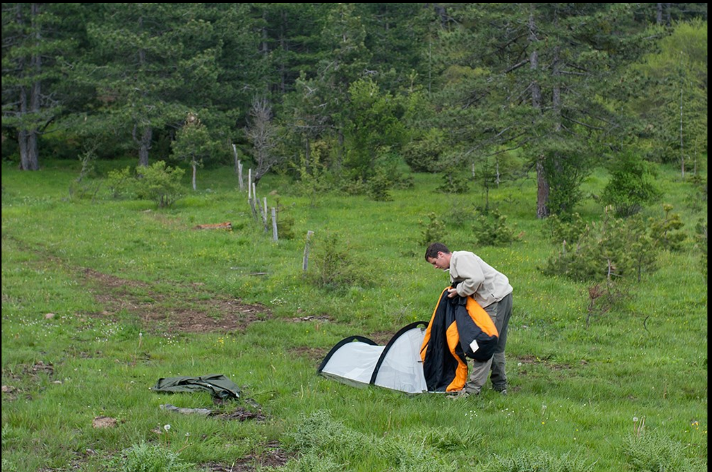
Just to take down the tent and start the car to get it warm.