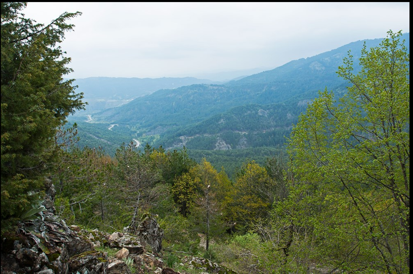
Under attack of The Eastern Pine Processionary ( Thaumatopoea pinivora ) the Pines was.