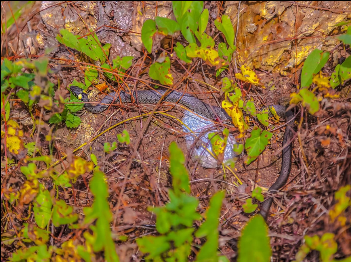
The European grass snake or ringed snake " Natrix natrix "