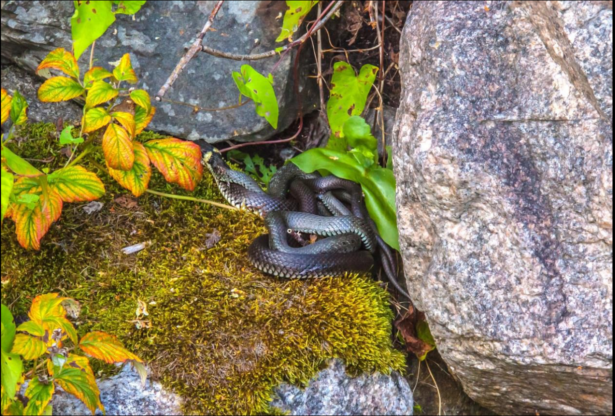
Natrix natrix having sex for fun