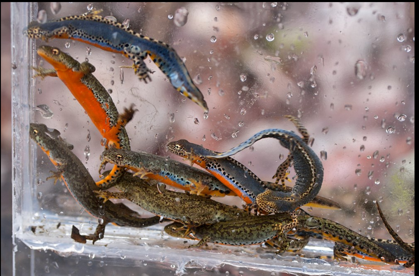
The after a while over crowded mini-aquaria. Alpine Newt ( Ichthyosaura or Triturus alpestris )