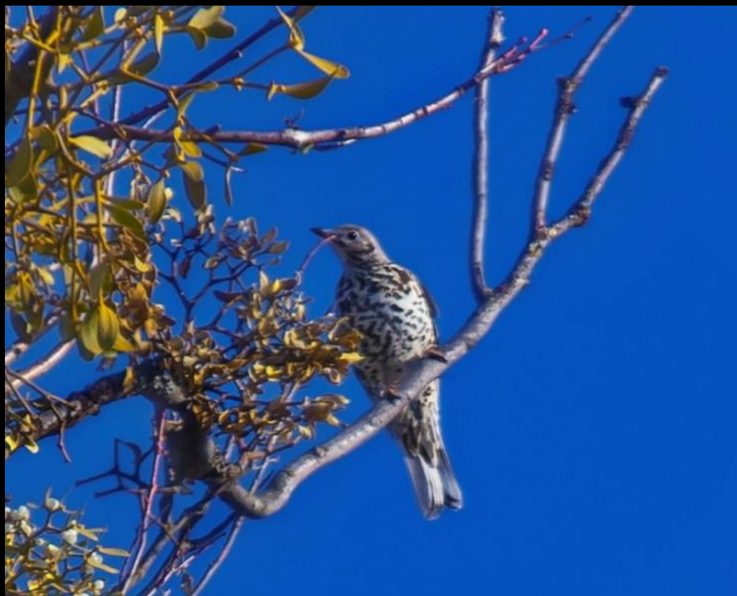
The Mistle Thrush ( Turdus viscivorus ) sitting in the alle