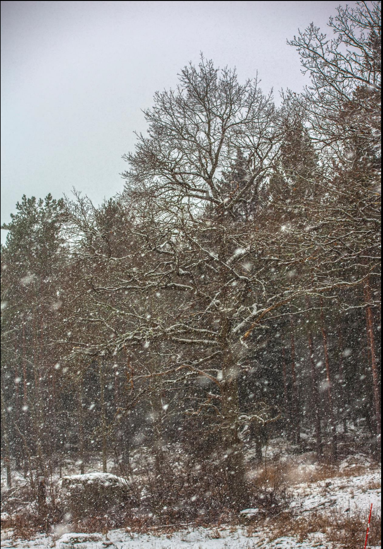
A snowy day, but we found snakes this day too