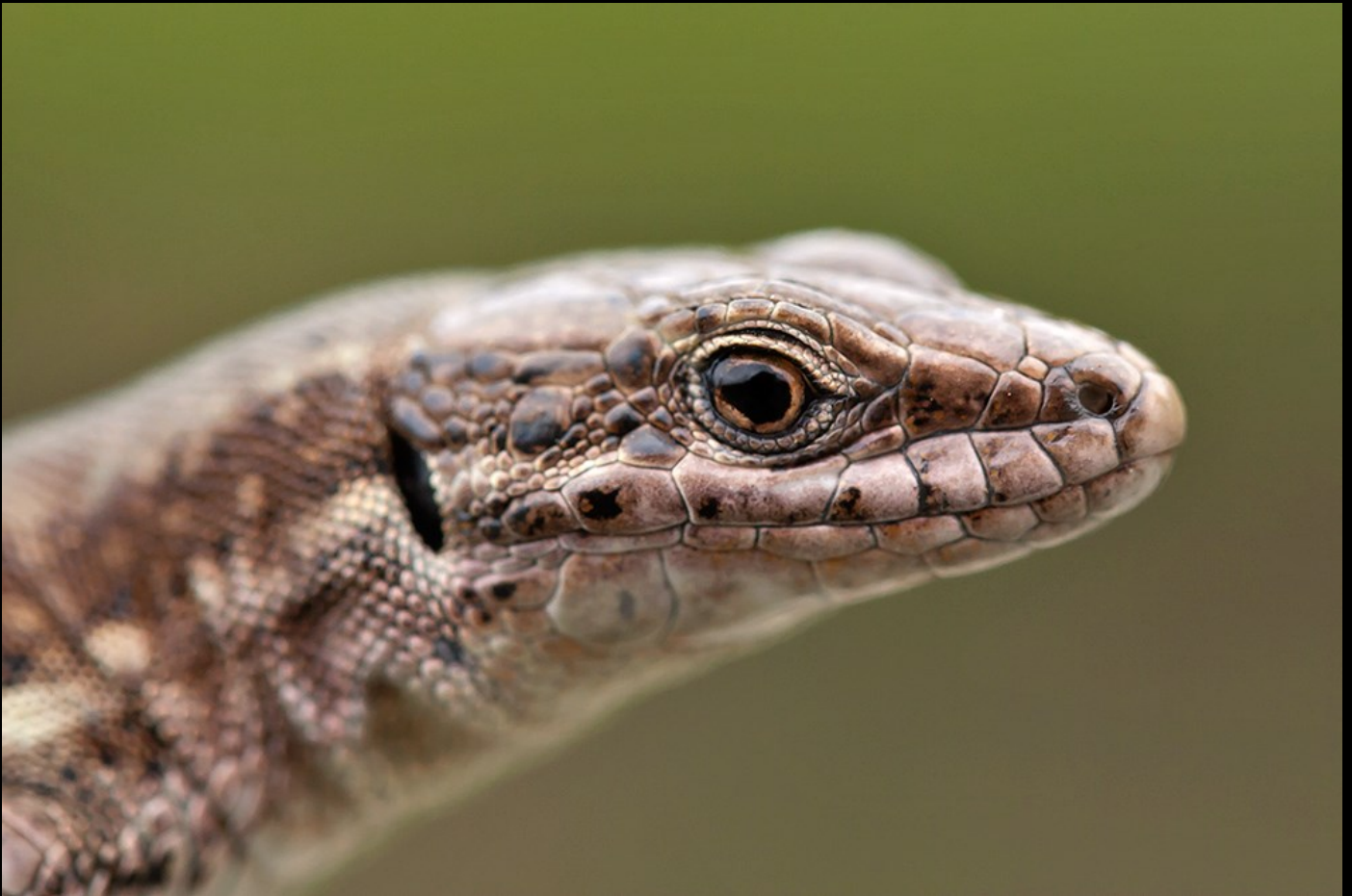
A portrait of a stiff wall lizard ( Podarcis muralis ) Alexander found under a stone beside the road.