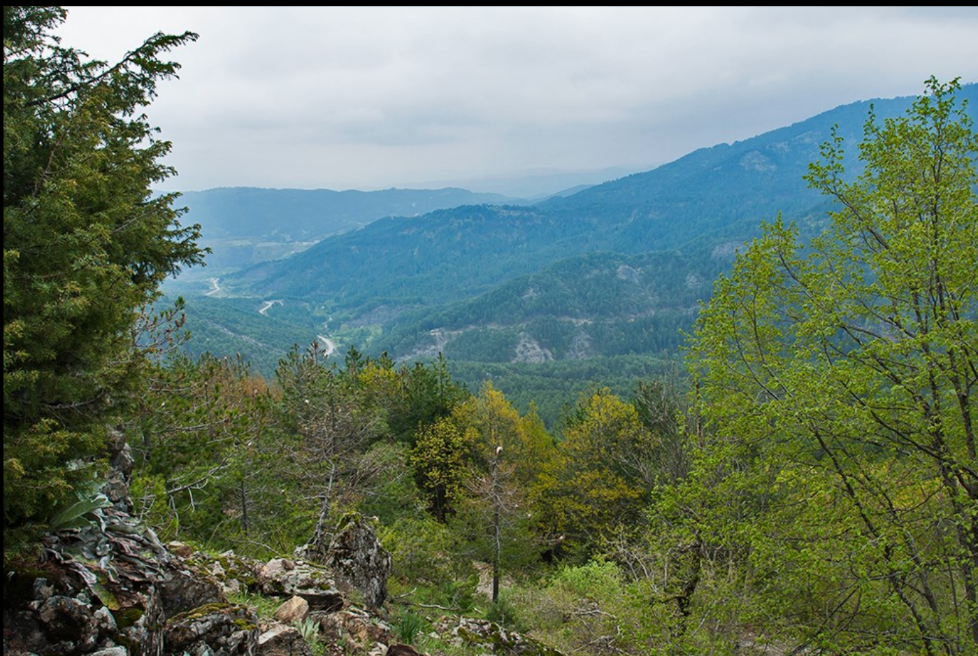
We saw the road deep down under us.