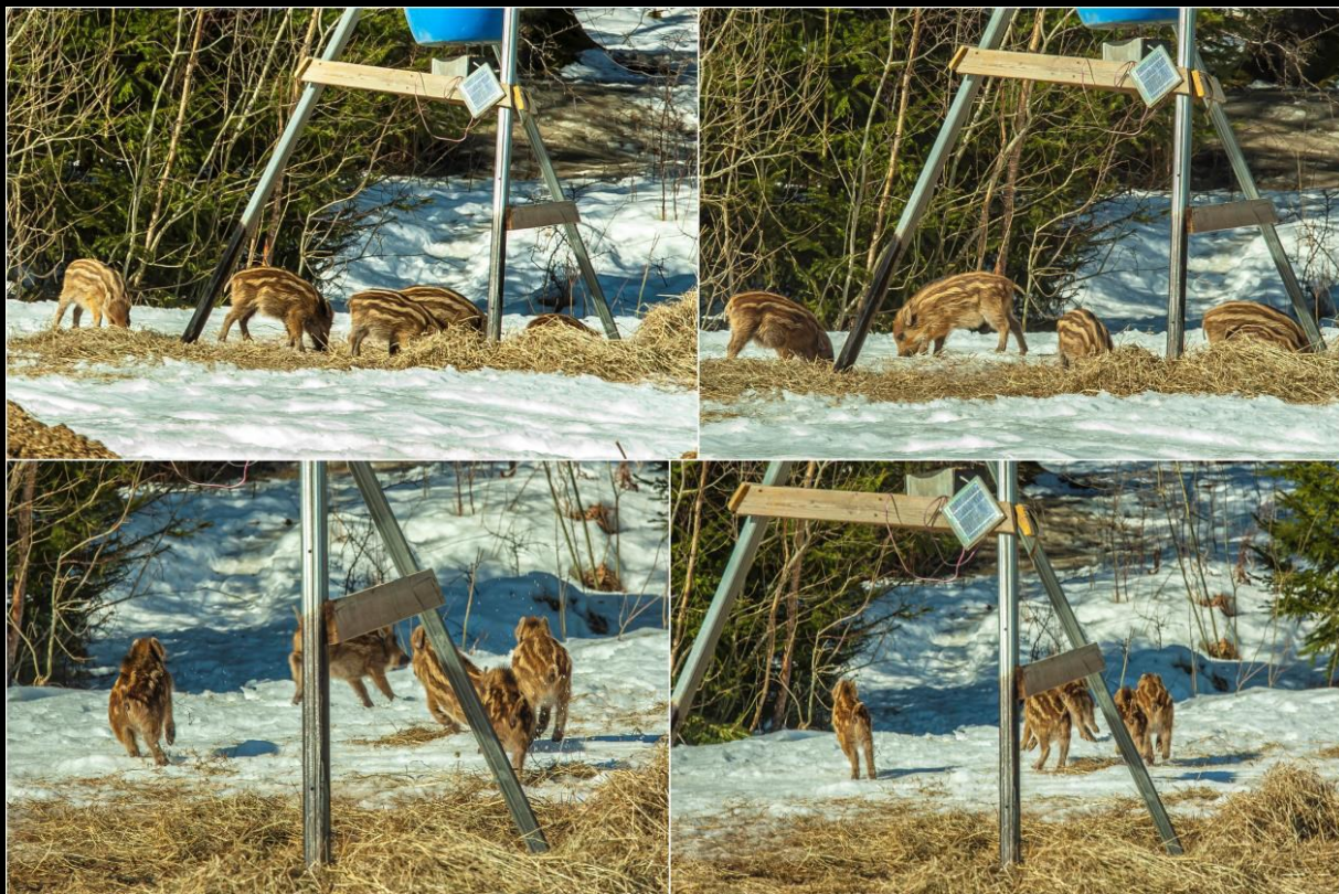
Wild boar piglets or wild piglets "Sus scrofa"