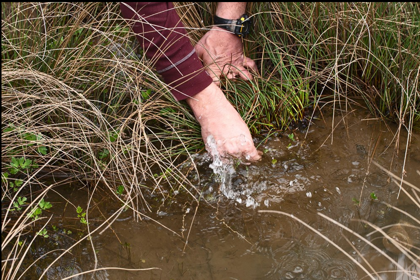
Fishing newts in ice cold water.