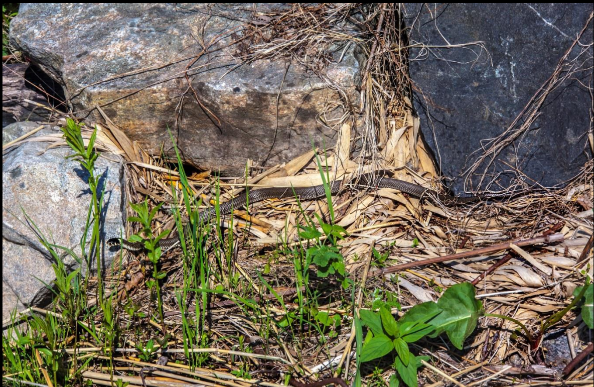
A European grass snake or ringed snake “ Natrix natrix ”