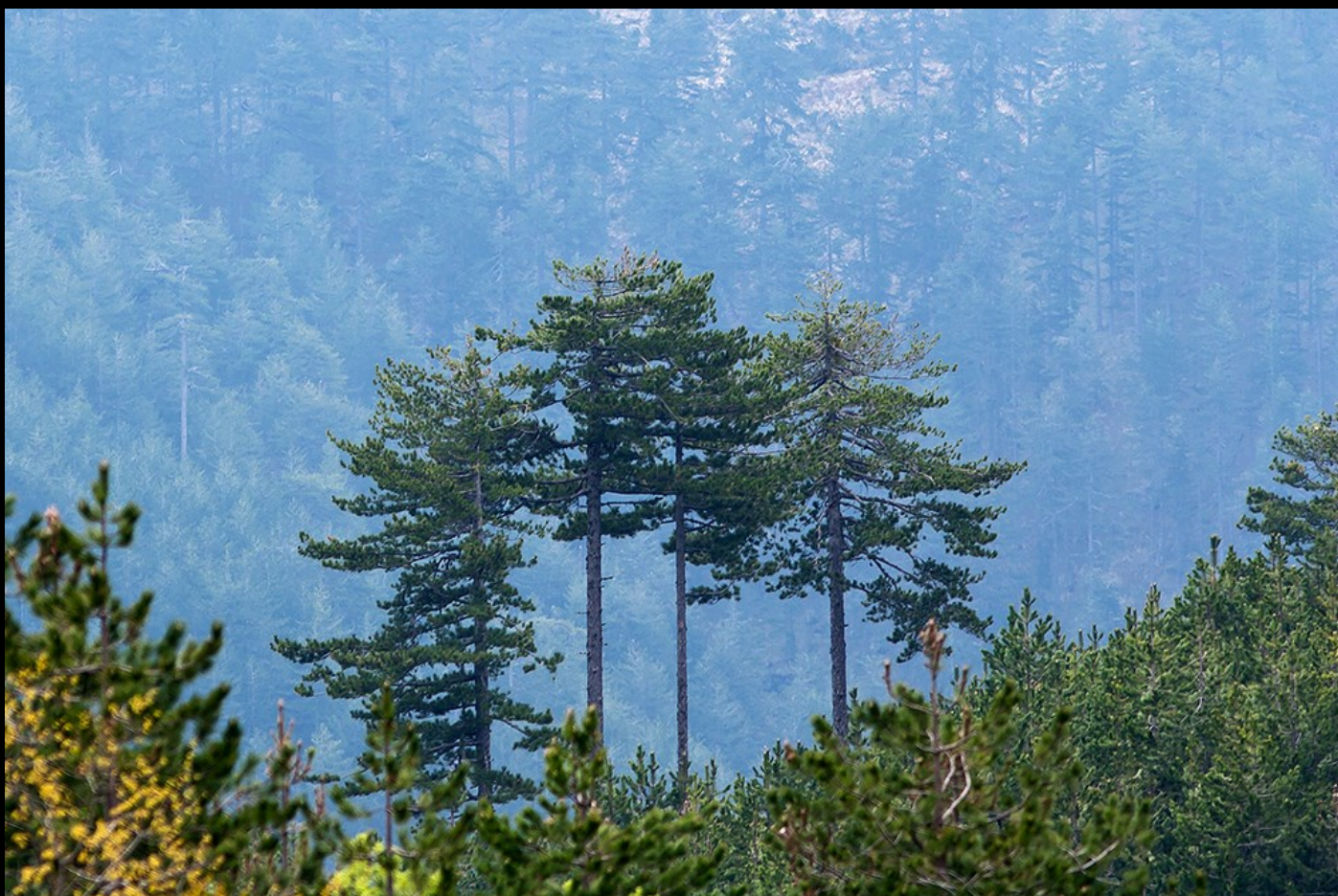
Nice Pine Trees in Pindos.