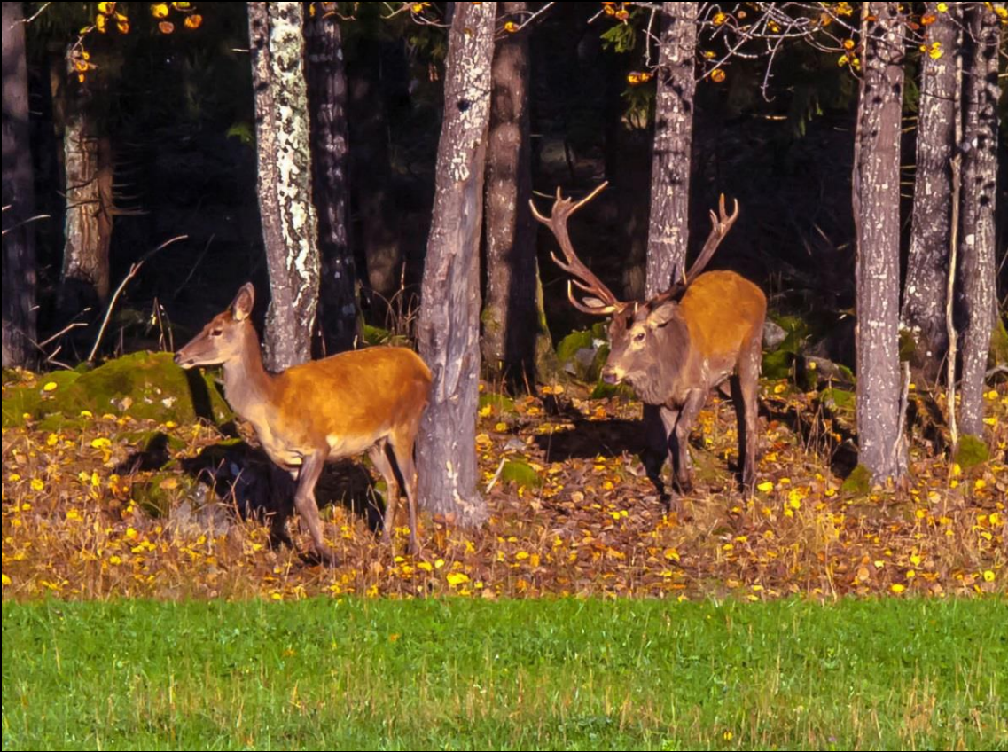
The red deer "Cervus elaphus"