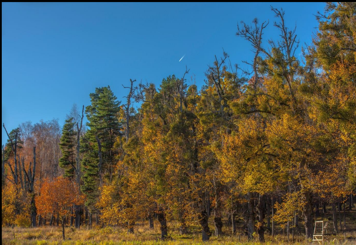
The Small-leaved Lime ” Tilia cordata ” - alley from the outside, summertime.