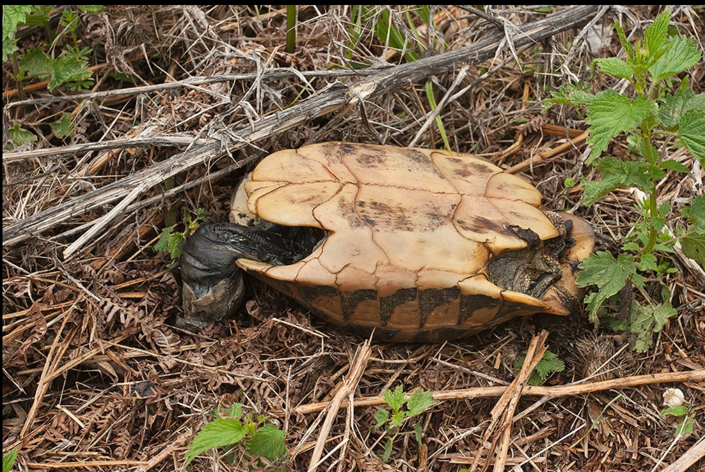
A dead tortoise found at an alpine meadow where it normally not occur. Milia, Greece.