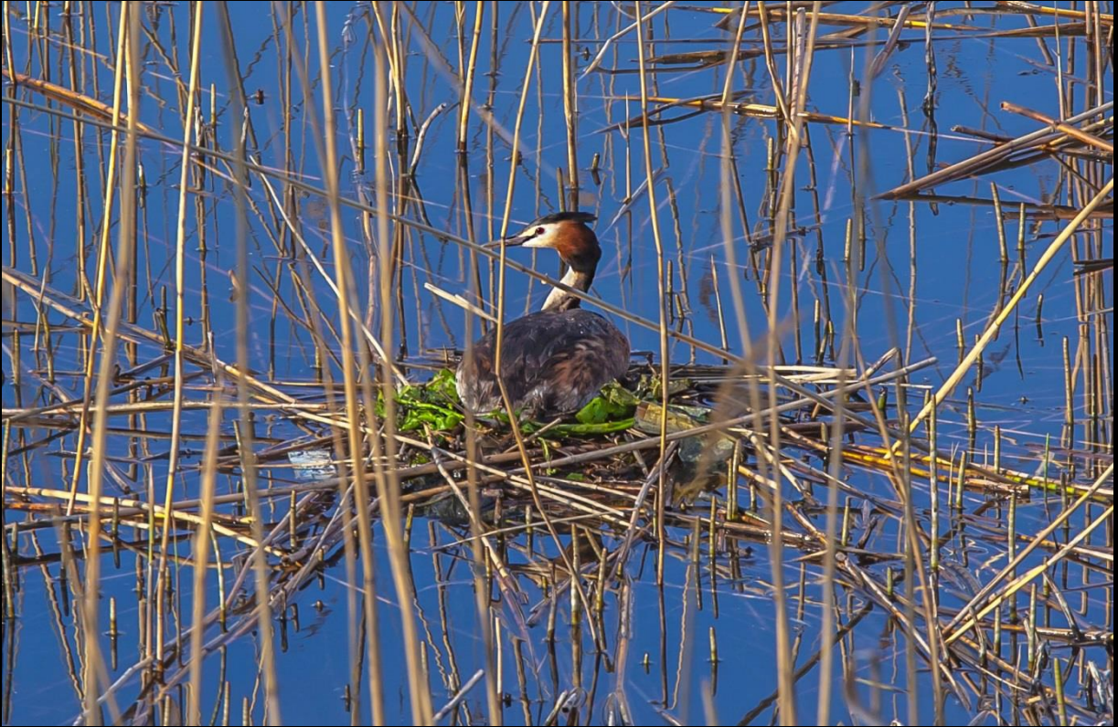
The Great Crested Grebe " Podiceps cristatus "