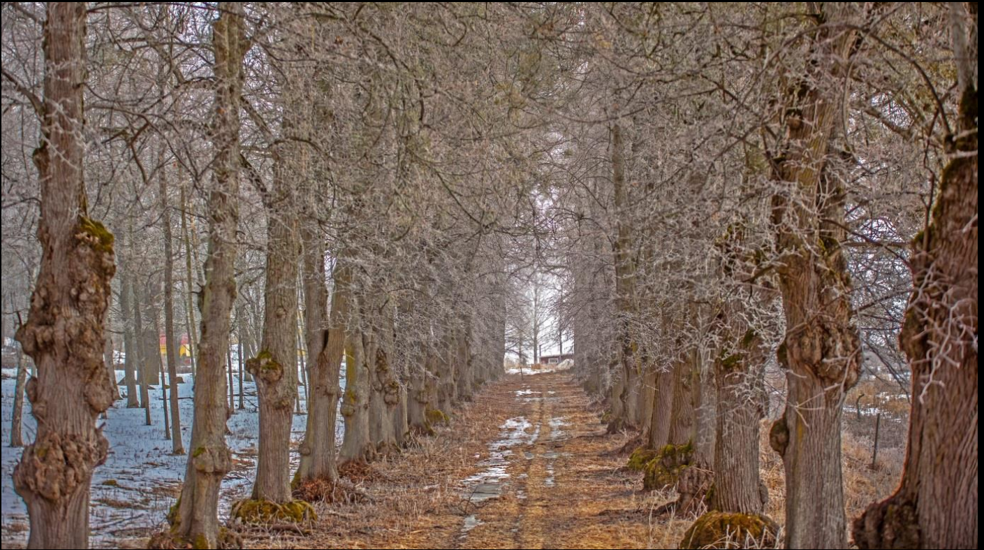
The Small-leaved Lime ” Tilia cordata ” - alley where all the trees are filled with Mistletoe