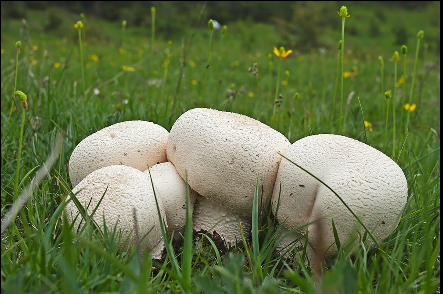
Big Puffballs we found near the dead tortoise.