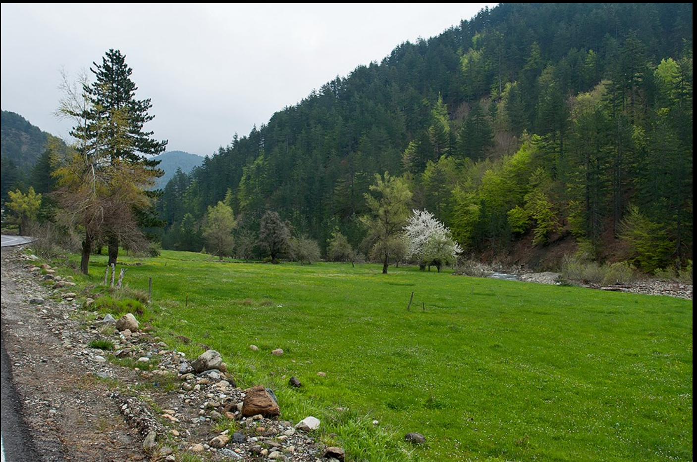
A nice meadow beside the road where we found Lacerta viridis , Podarcis muralis and Lacerta agilis some years ago on another trip when the sun was shining.