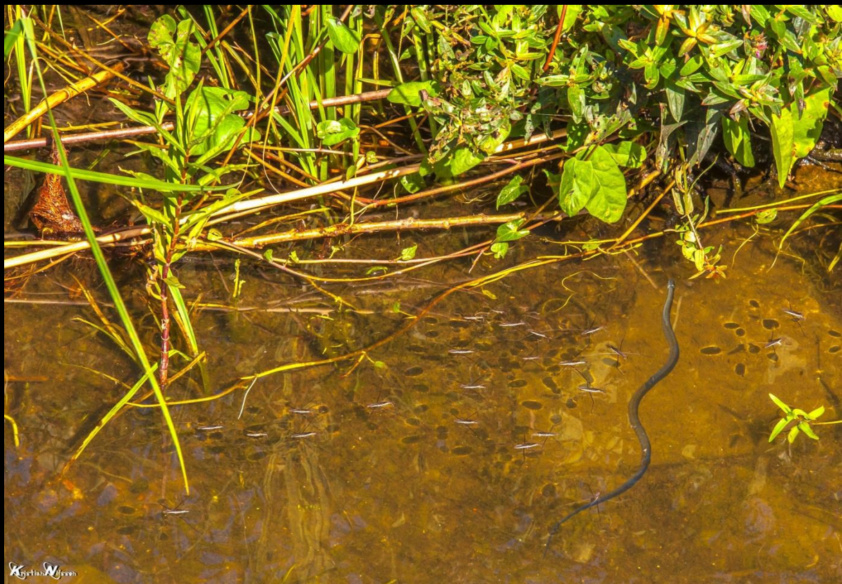
A European grass snake or ringed snake “ Natrix natrix ” and a lot of Water striders “ Gerris remigis ”