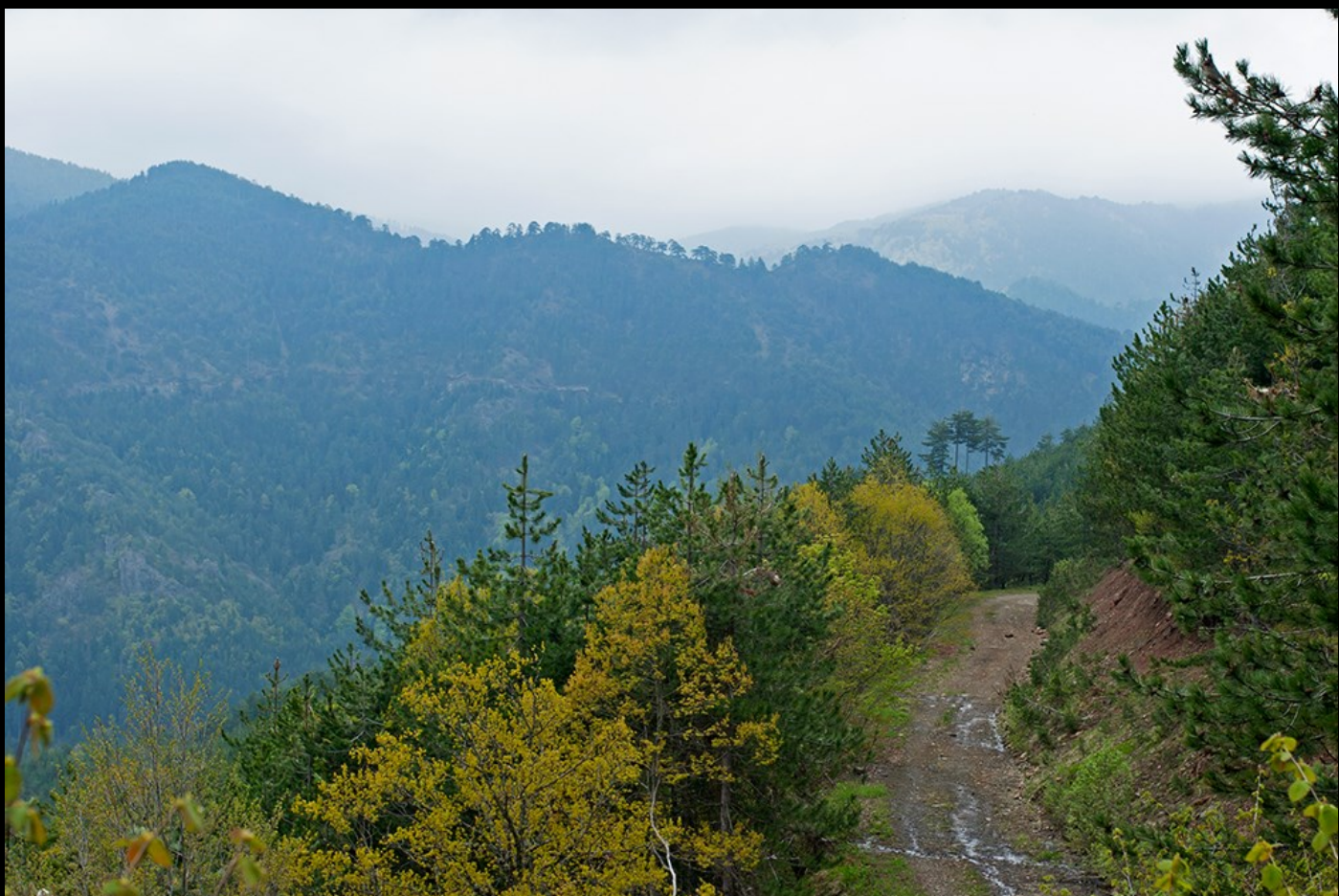
The logger's road up in the mountains we found. Milia.