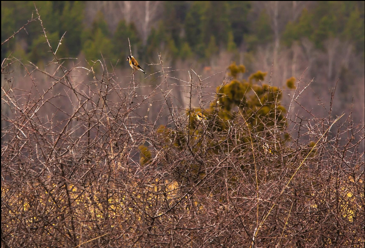
The European Goldfinch "Carduelis carduelis"