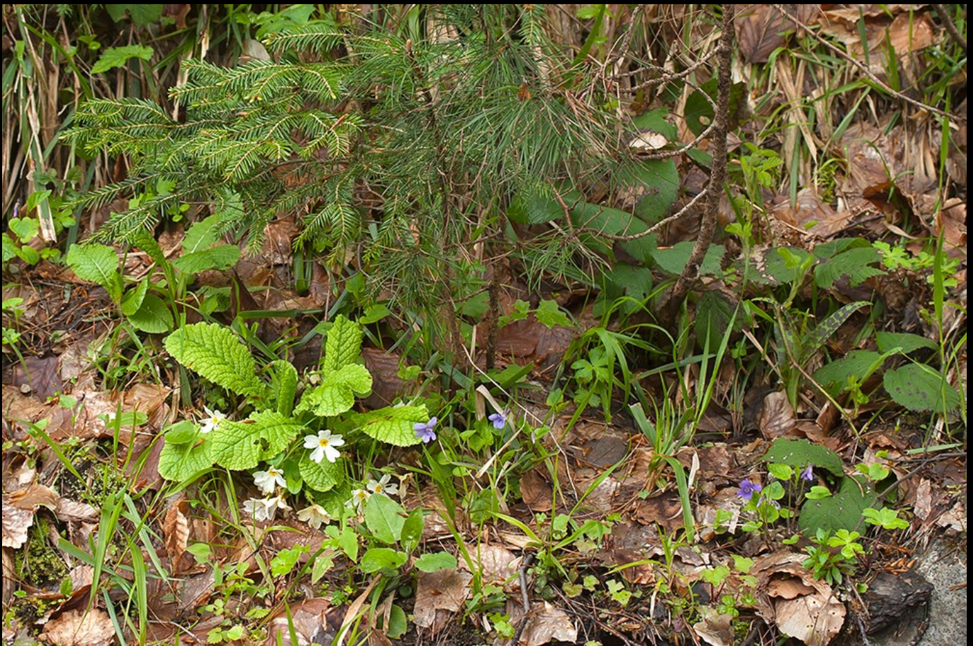
Spring flowers. Primula sp and others. Milia, Greece.