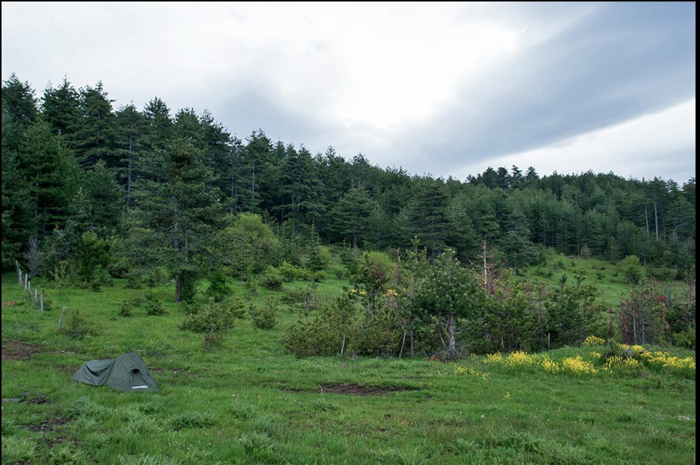
Early morning on the Dead Tortoises Meadow high up in the mountains around Milia.