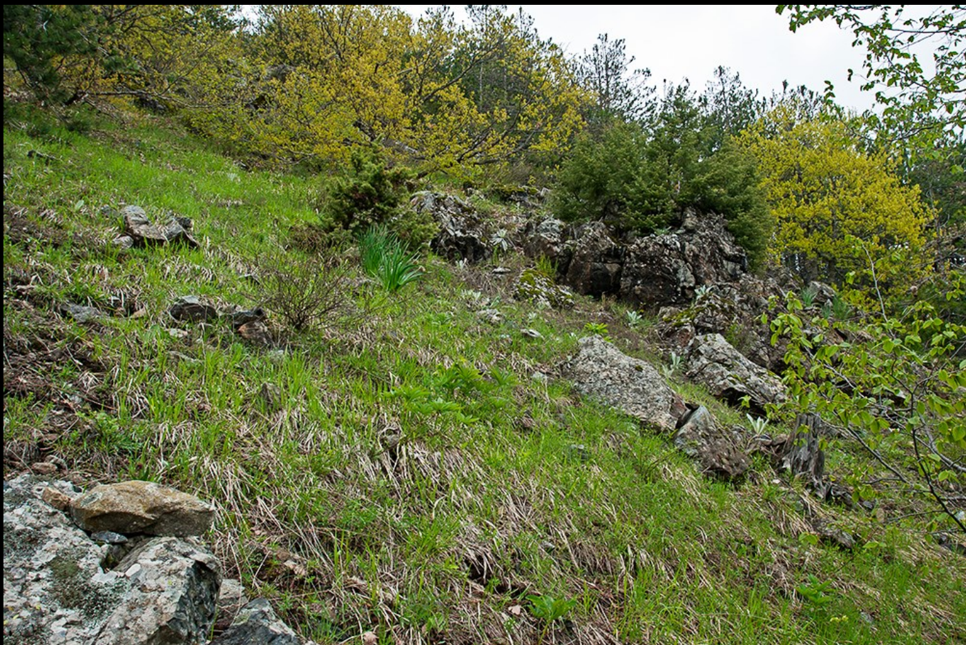
A possible habitat for the Bosnian Adder ( Vipera berus bosniensis )