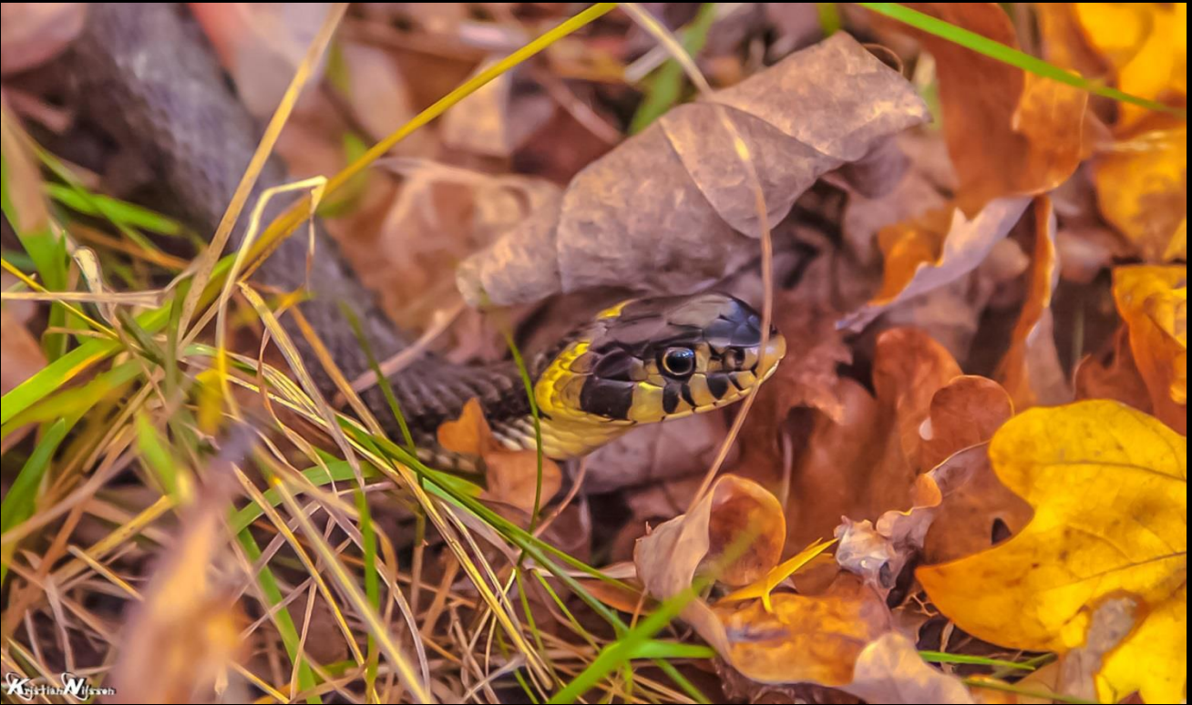
The European grass snake or ringed snake " Natrix natrix "