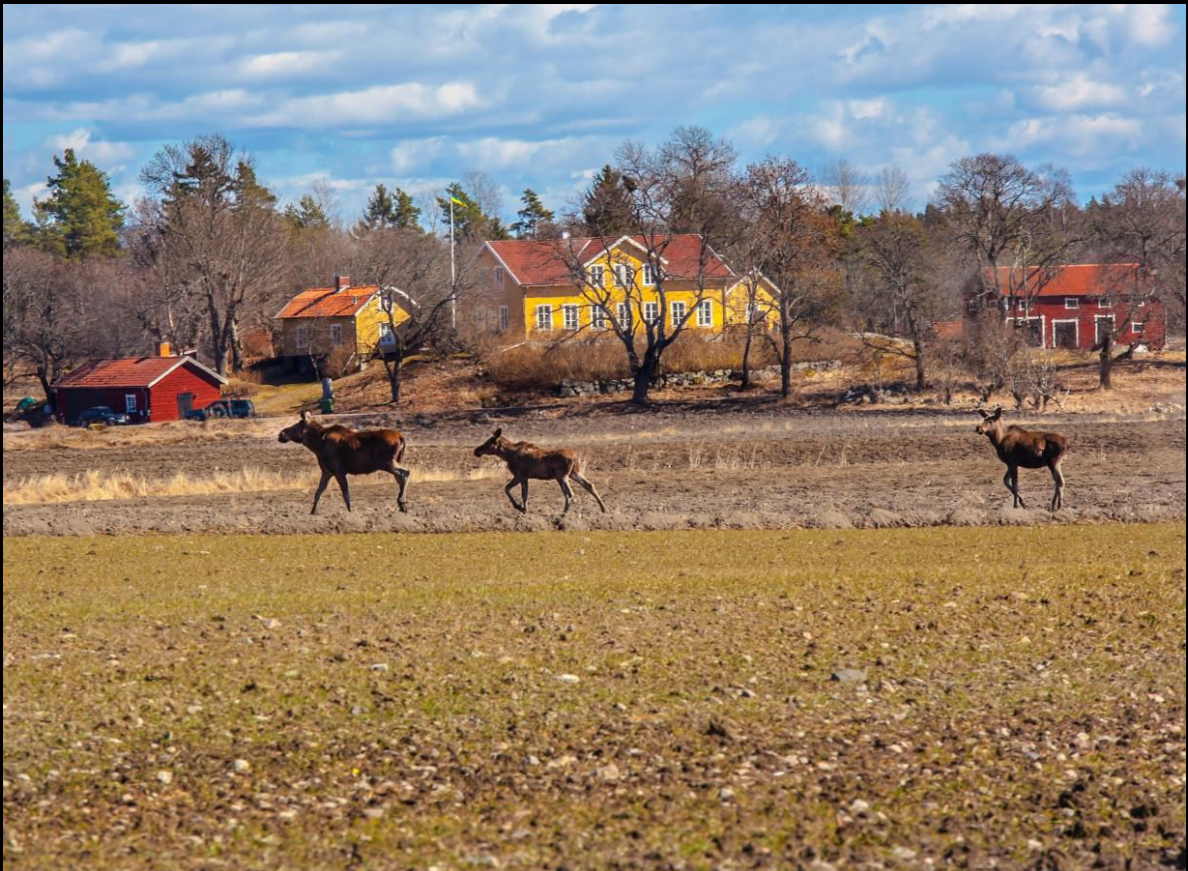
The moose or Eurasian elk "Alces alces"