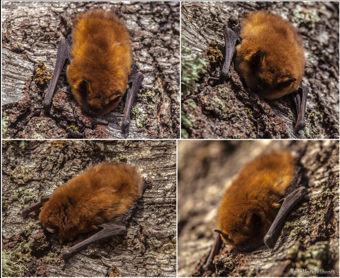
Northern bat "Eptesicus nilssonii"