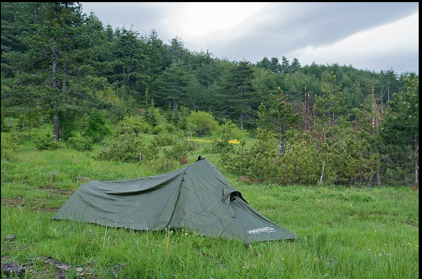
A cold awakening in the Dead Tortoises Meadow