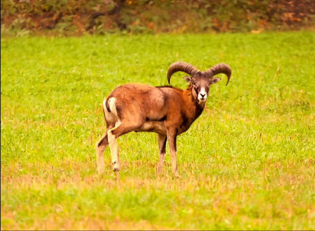
The mouflon " Ovis orientalis orientalis "