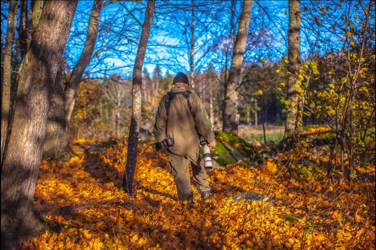
Leffe slowly moves towards the deers