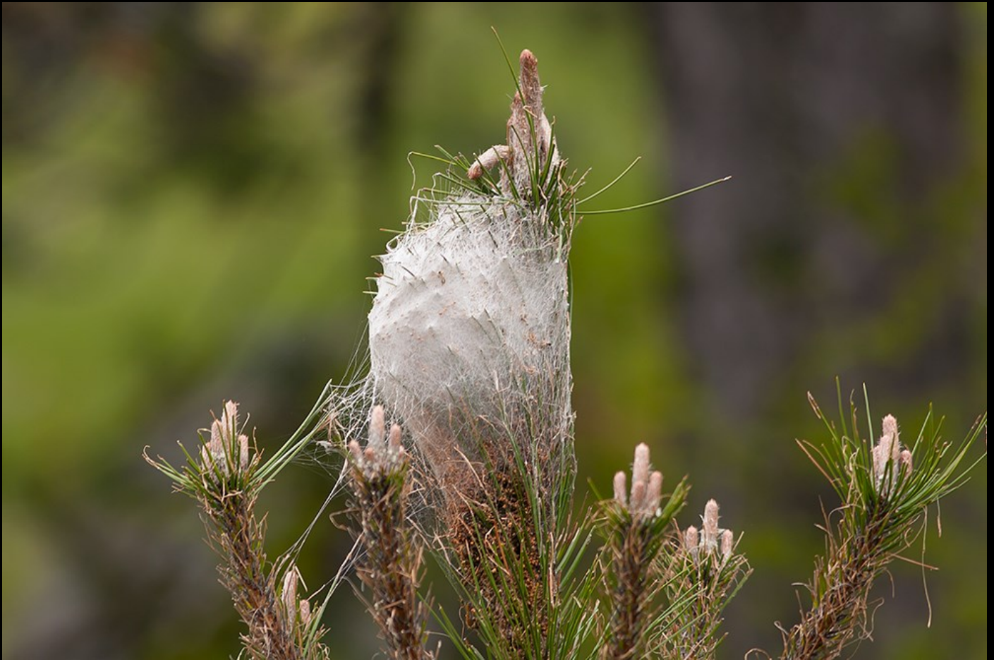
The cocoons of The Eastern Pine Processionary ( Thaumatopoea pinivora )