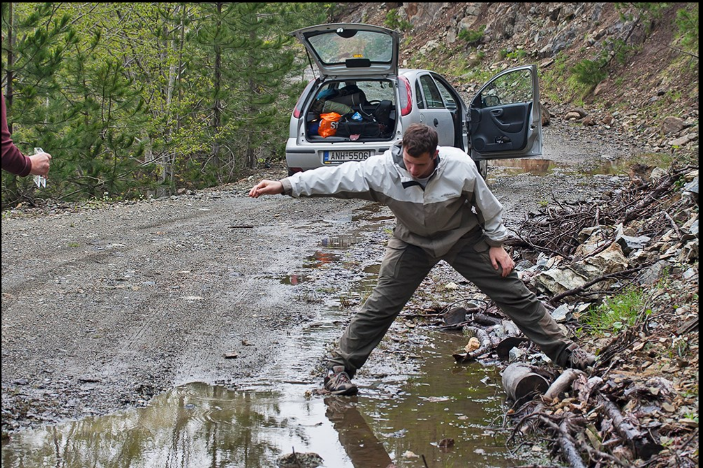
More newt picking.