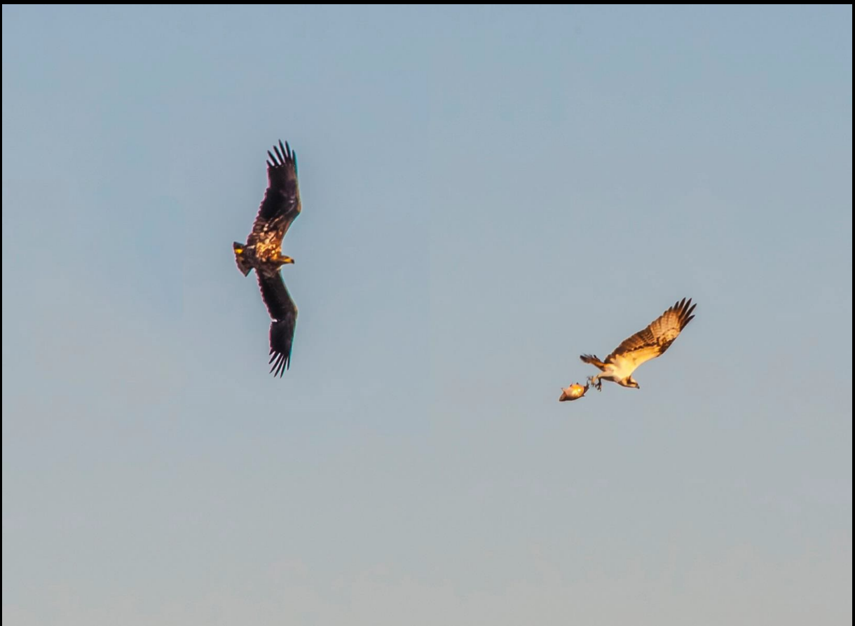
Suddenly a White-tailed Eagle " Haliaeetus albicilla " shows up chasing an Osprey " Pandion haliaetus " with a Common bream " Abramis brama "