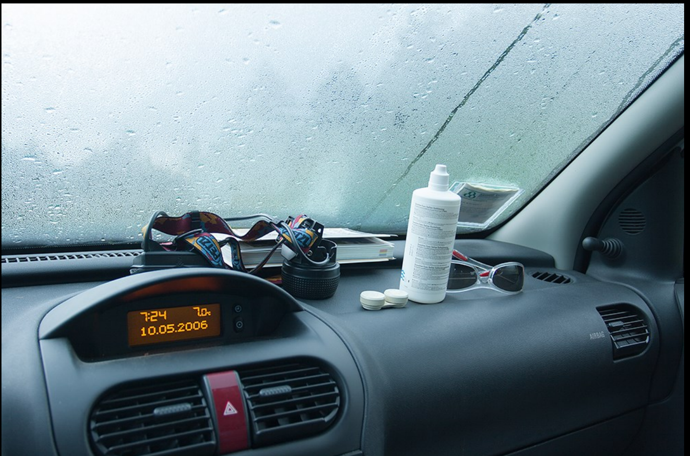
Awakening a wet ice cold morning in the car high up in the forest of Milia.