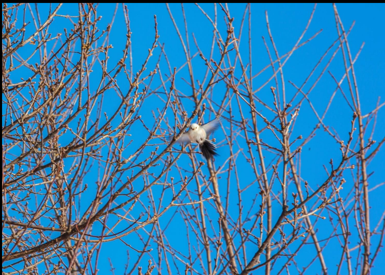
The Long-tailed Tit or Long-tailed Bushtit " Aegithalos caudatus "