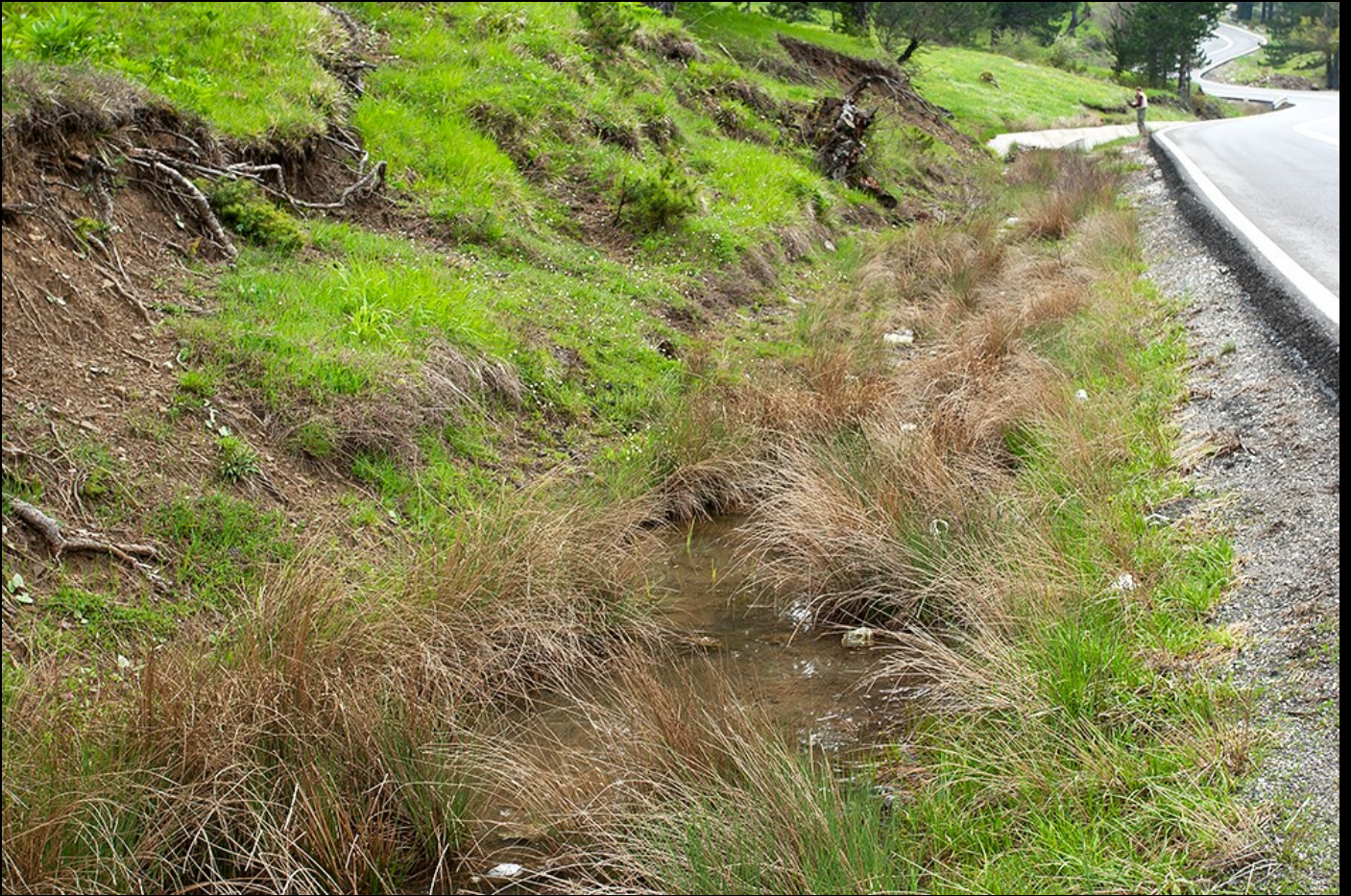
A simple ditch near the road a habitat for Triturus (Ichtyosaura) alpestris and Bombina variegata .