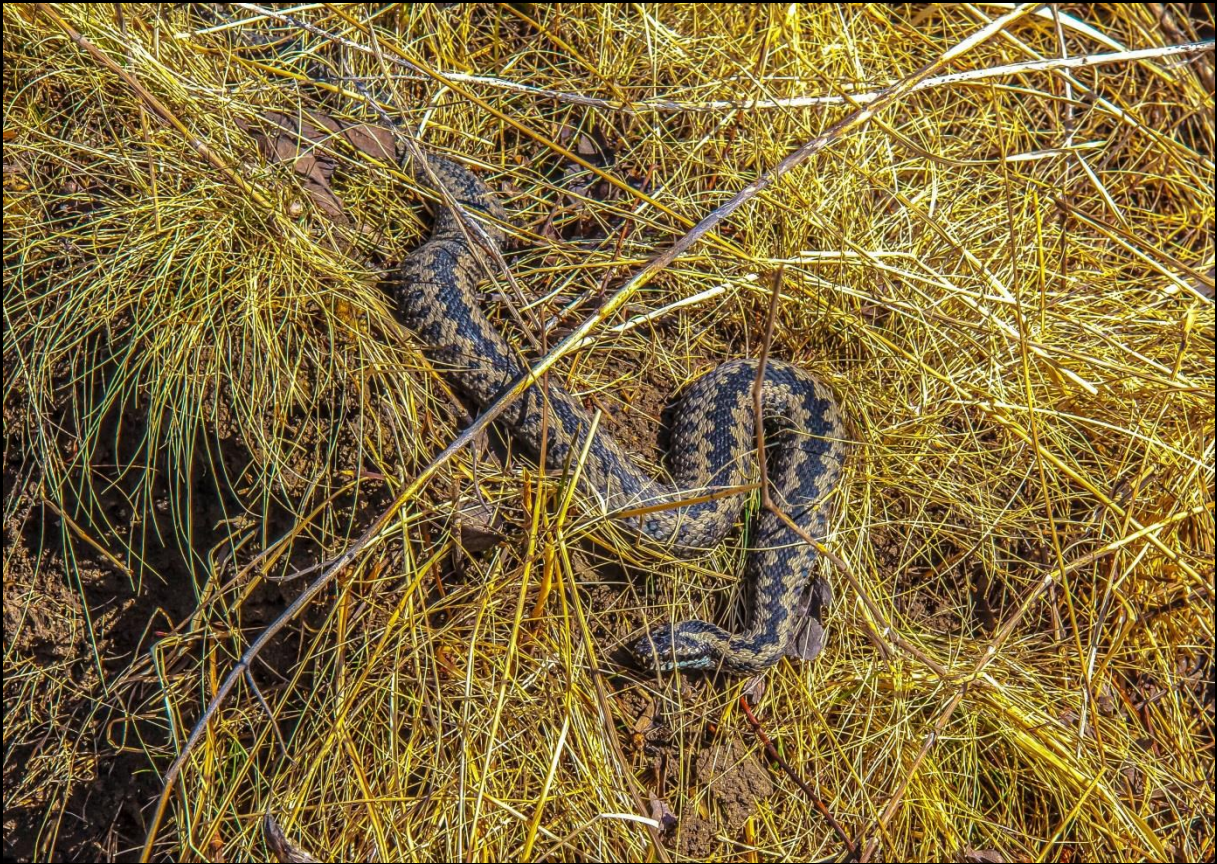
The common European adder or viper " Vipera berus "